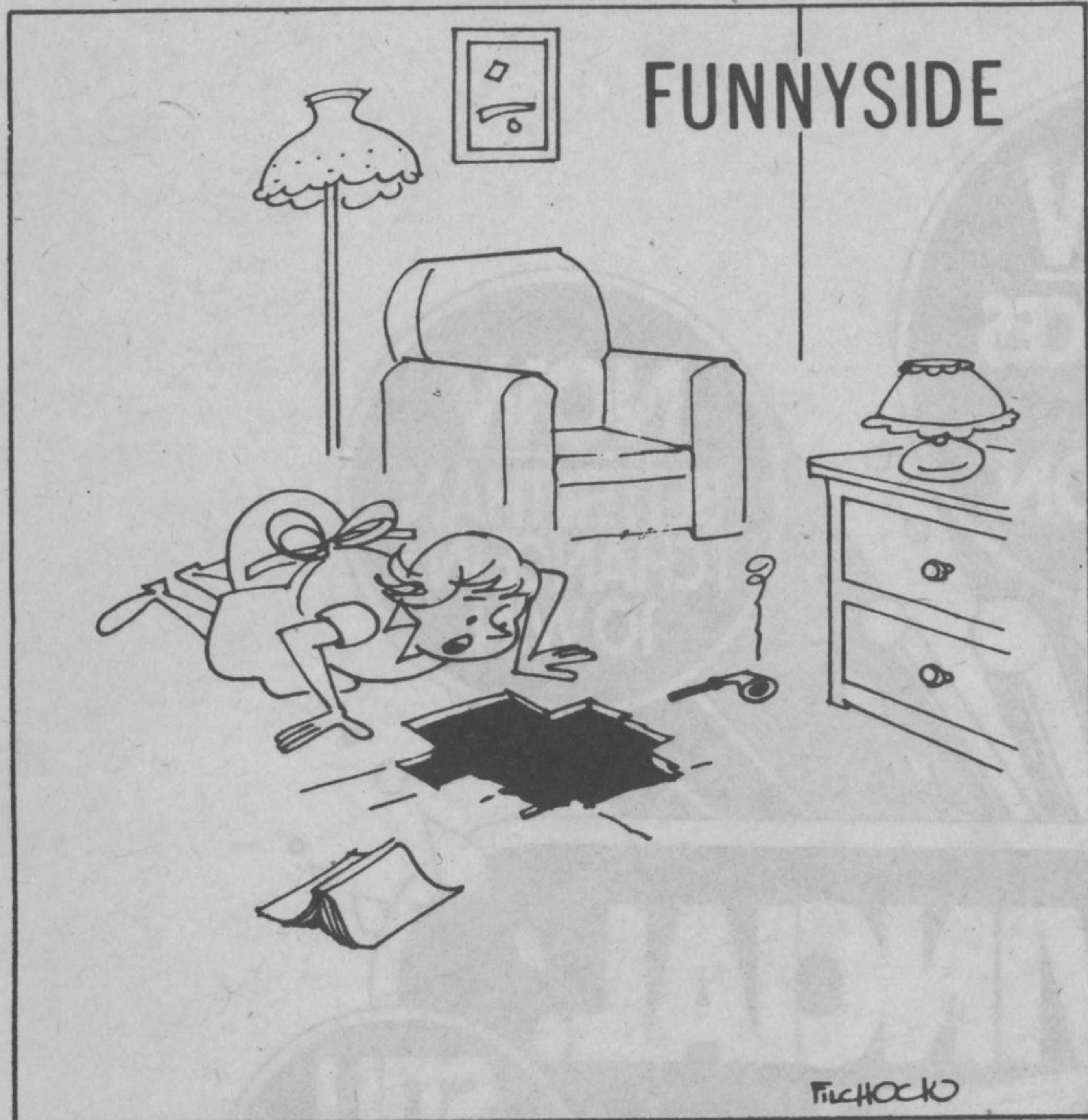
"Now, will you believe we have termites?"