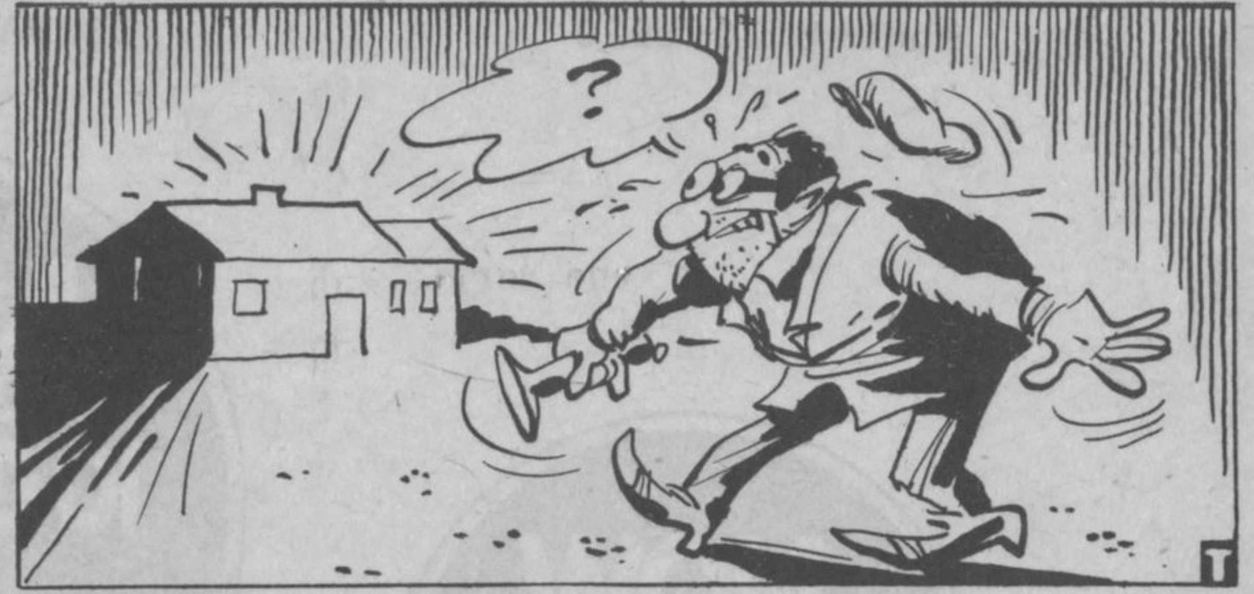
REPLACING THE ORDINARY light switch, the computerized unit controls lights in a way designed to discourage burglars.