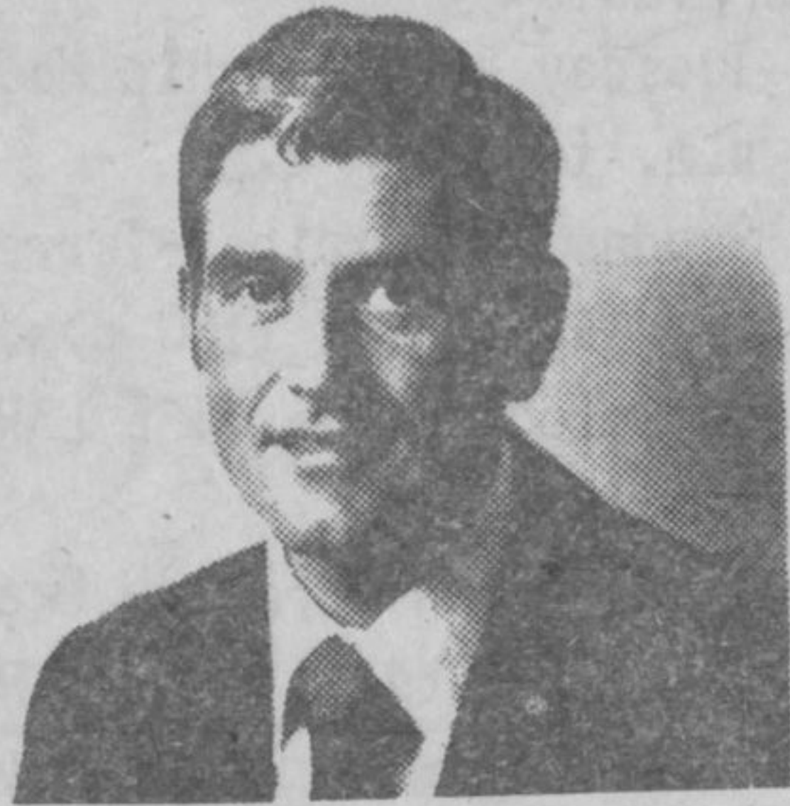
BY JIM TRISTRAM