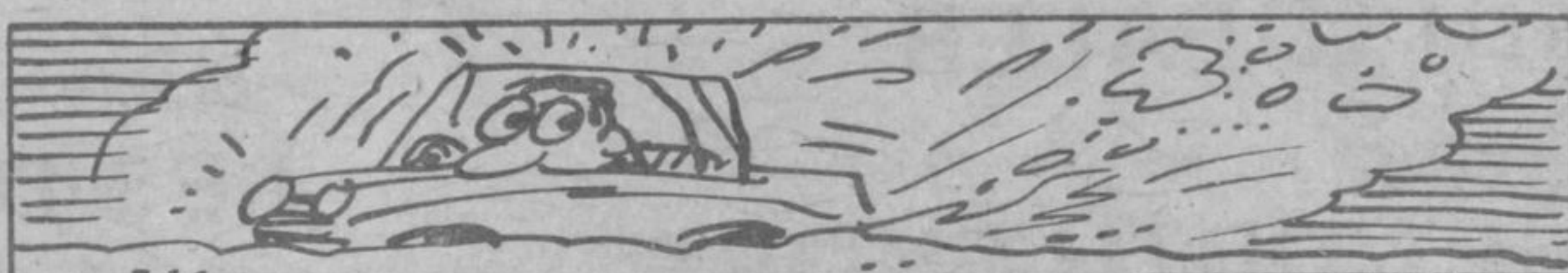
If your car gets stuck in snow, never spin wheels, even for an instant. This just digs the car in deeper.