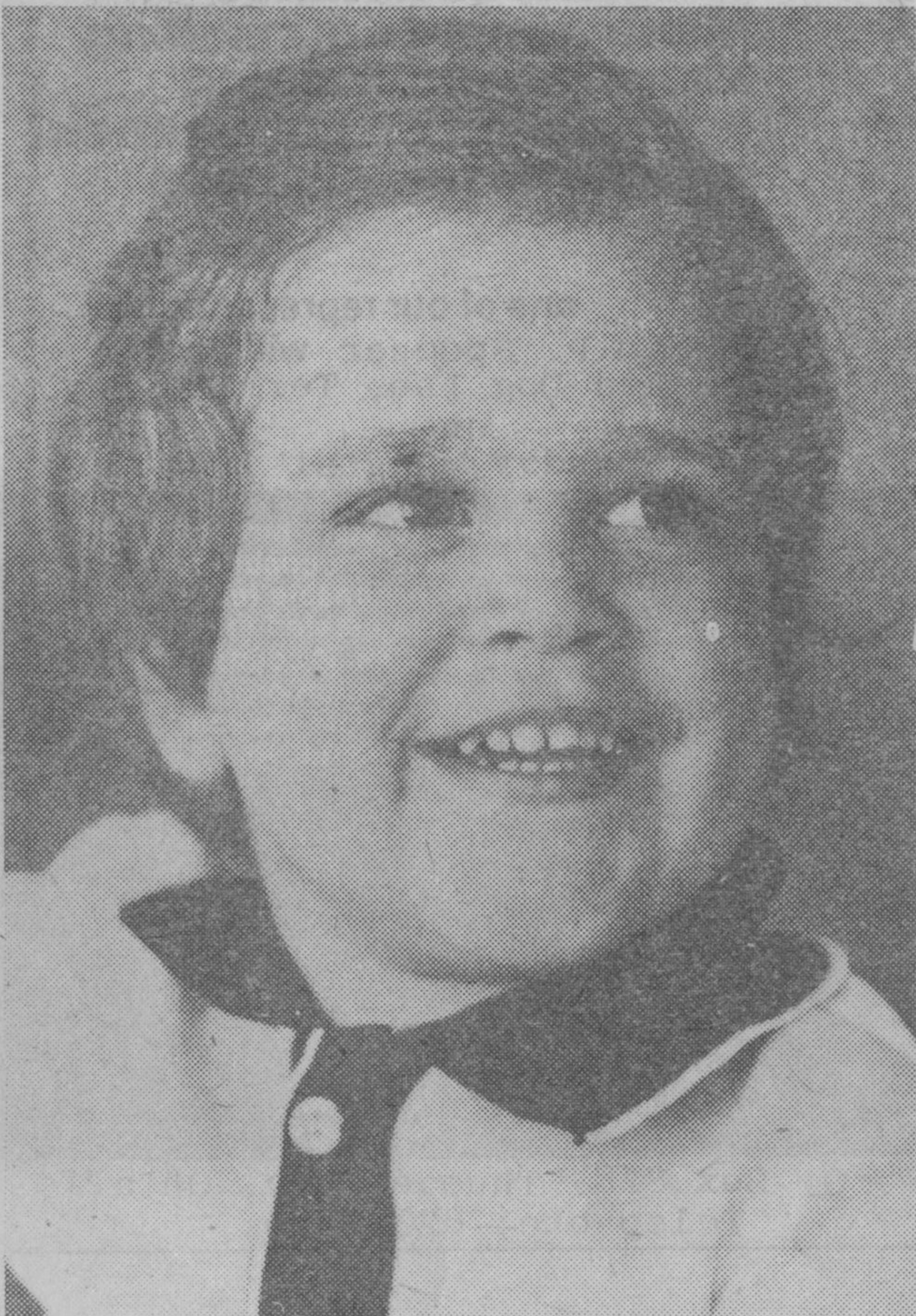
NEEDS SECURITY AND ACCEPTANCE

For general adoption information, contact your local Children's Aid Society.