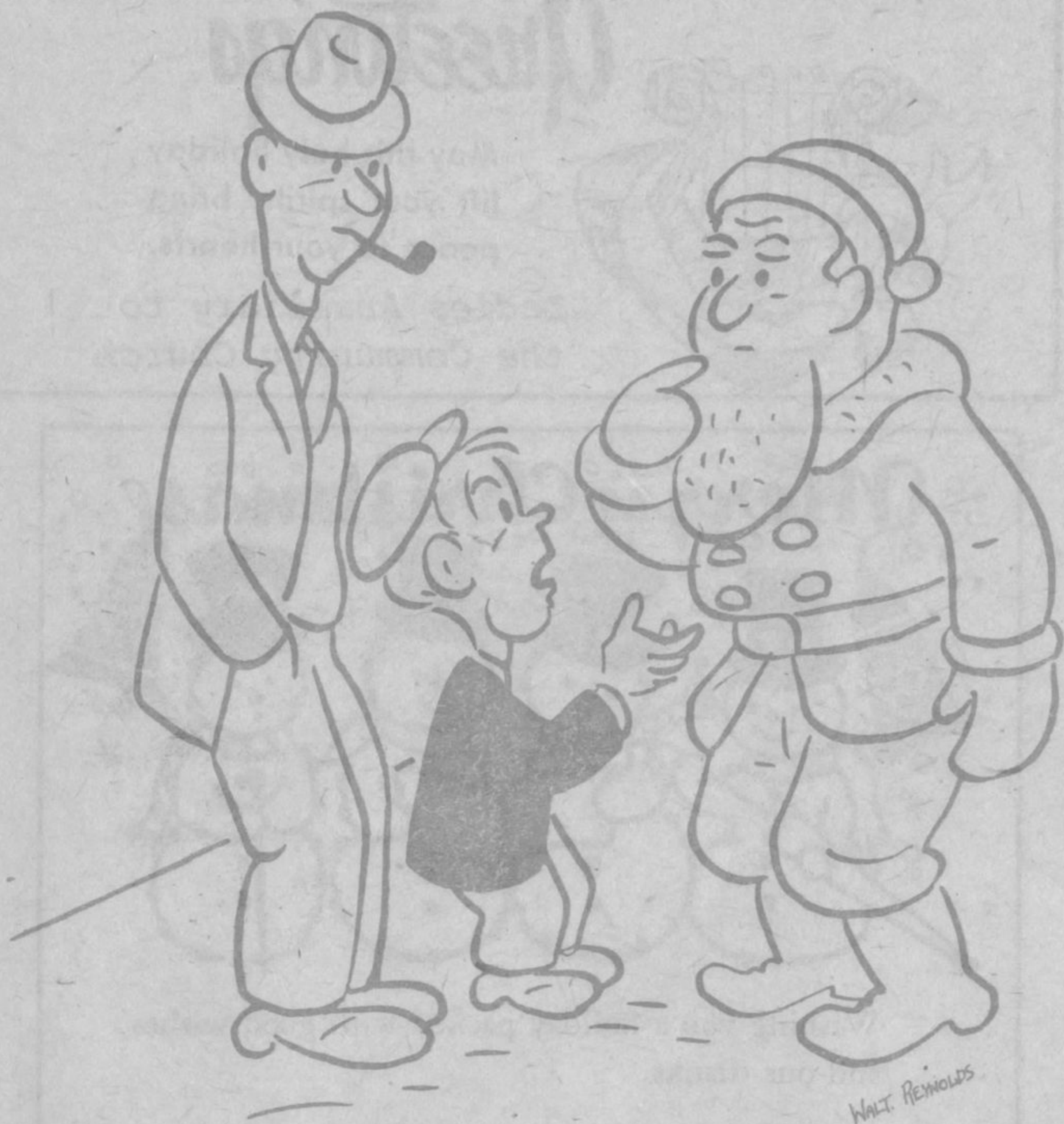
"Gee Santa, you're Forgetful, I just told you across the street that I wanted an electric train for Christmas!"