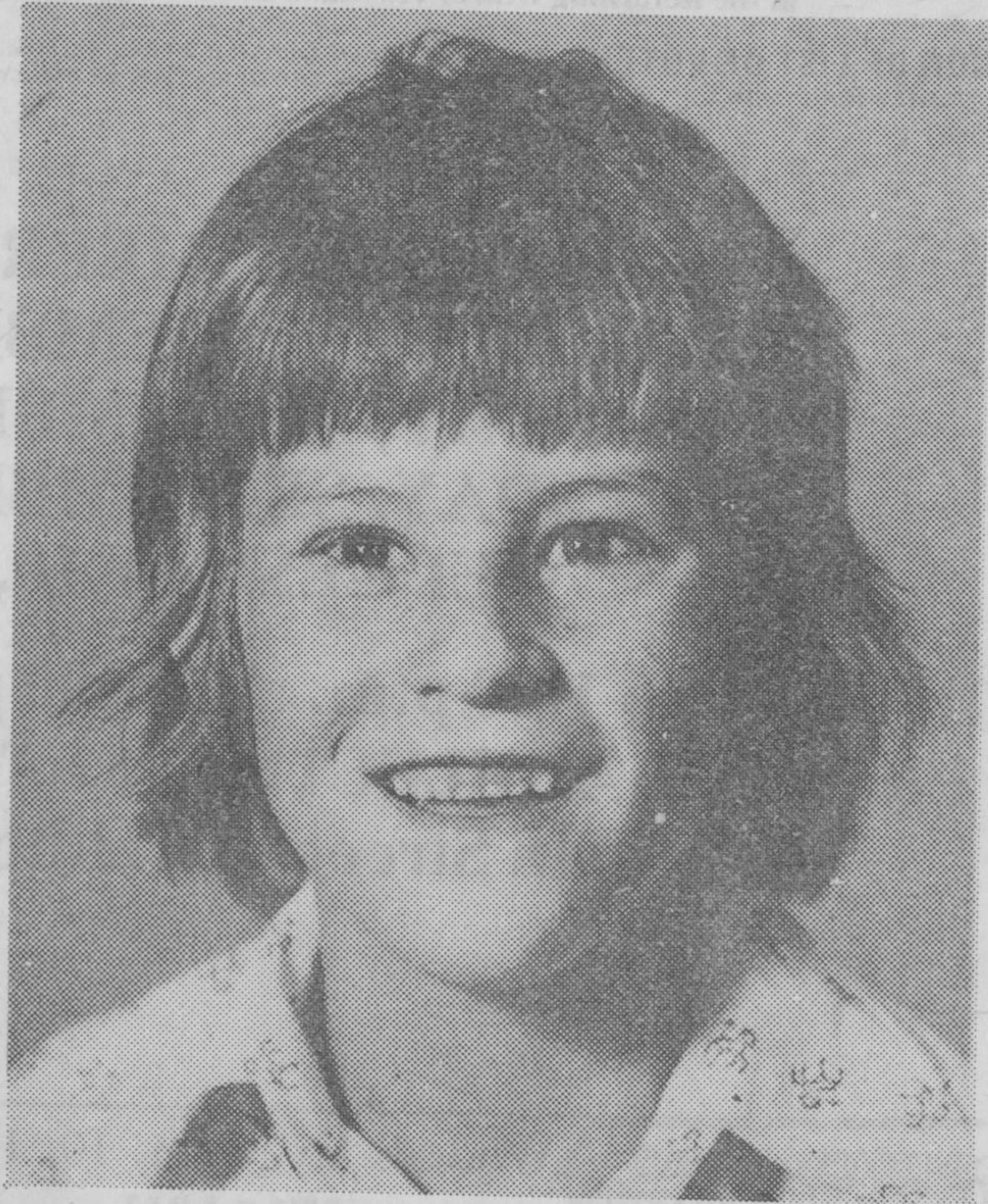
HE'S EAGER TO LEARN

For general information, consult your local Children's Aid Society.