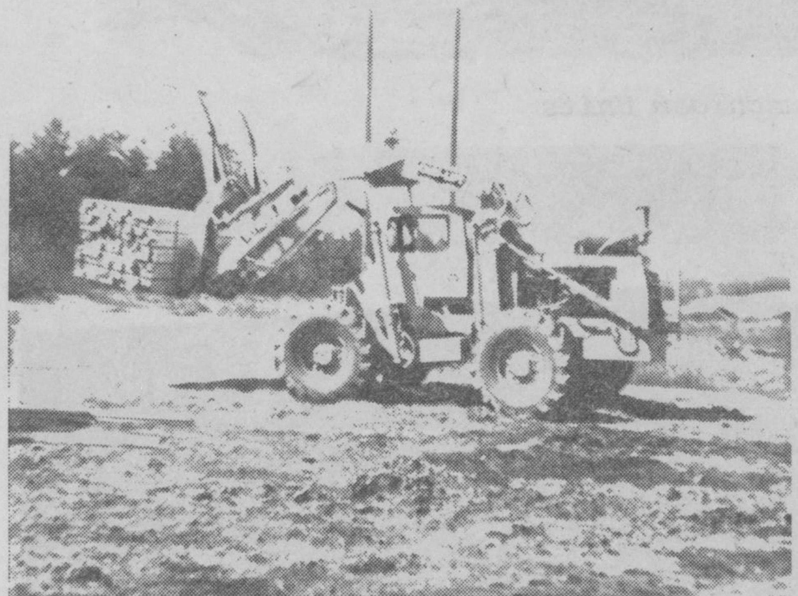
The Mobile Units have been shipped from Lethbridge.

Also some twelve men mobile units are to be erected soon.