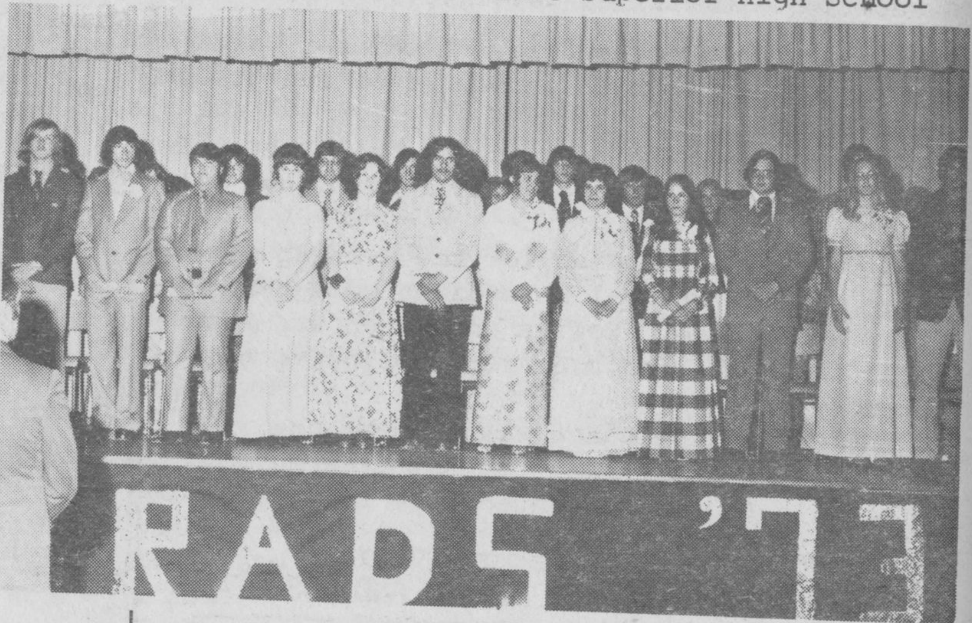
- Graduation photos by F. Commisso