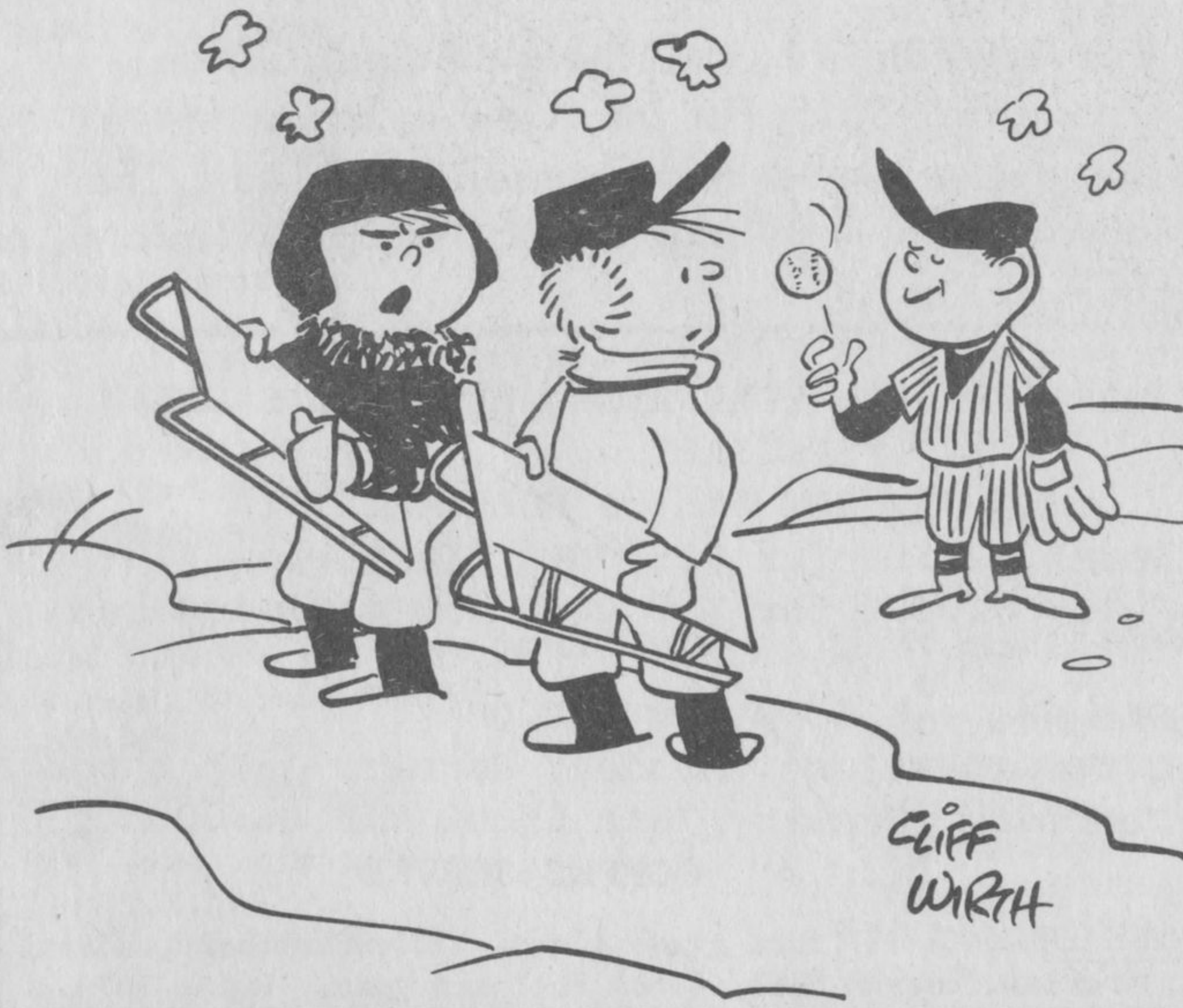
"I don't think he'll ever forget that no-hit game he pitched!"