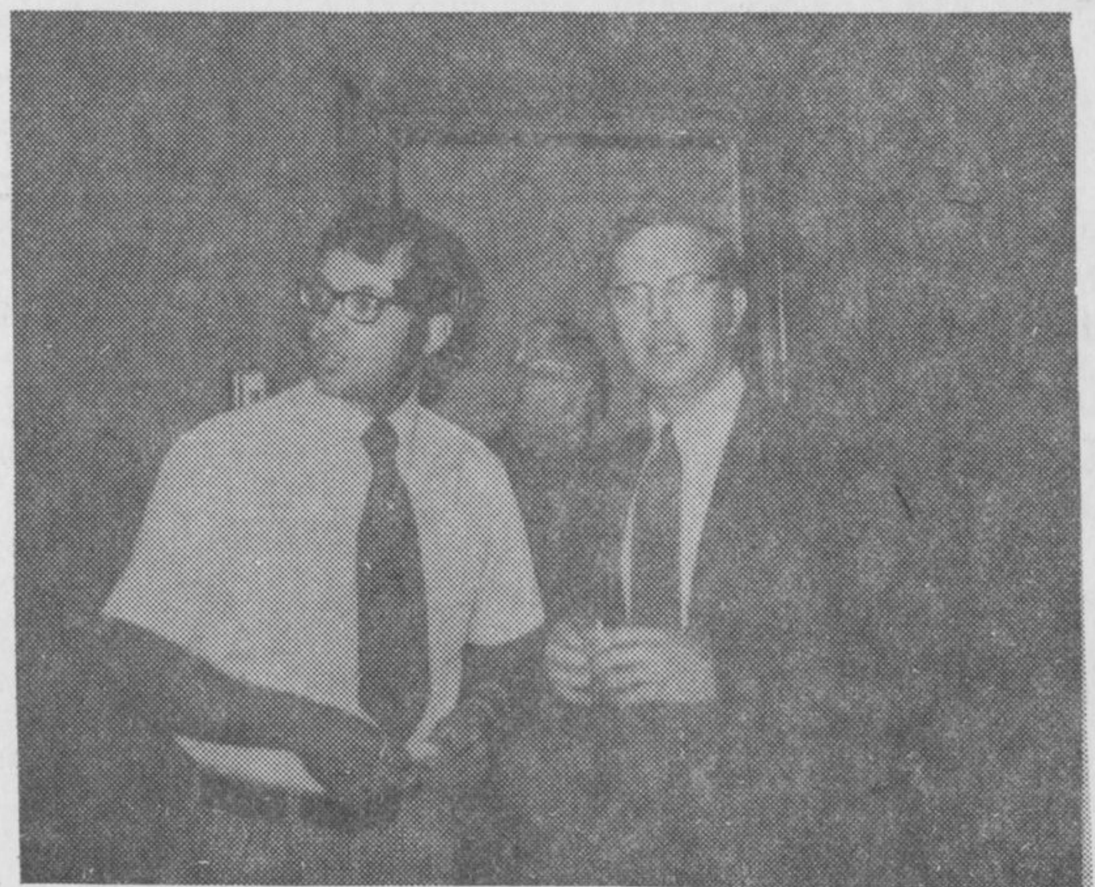
Caccamo, Schreiber Hydro.