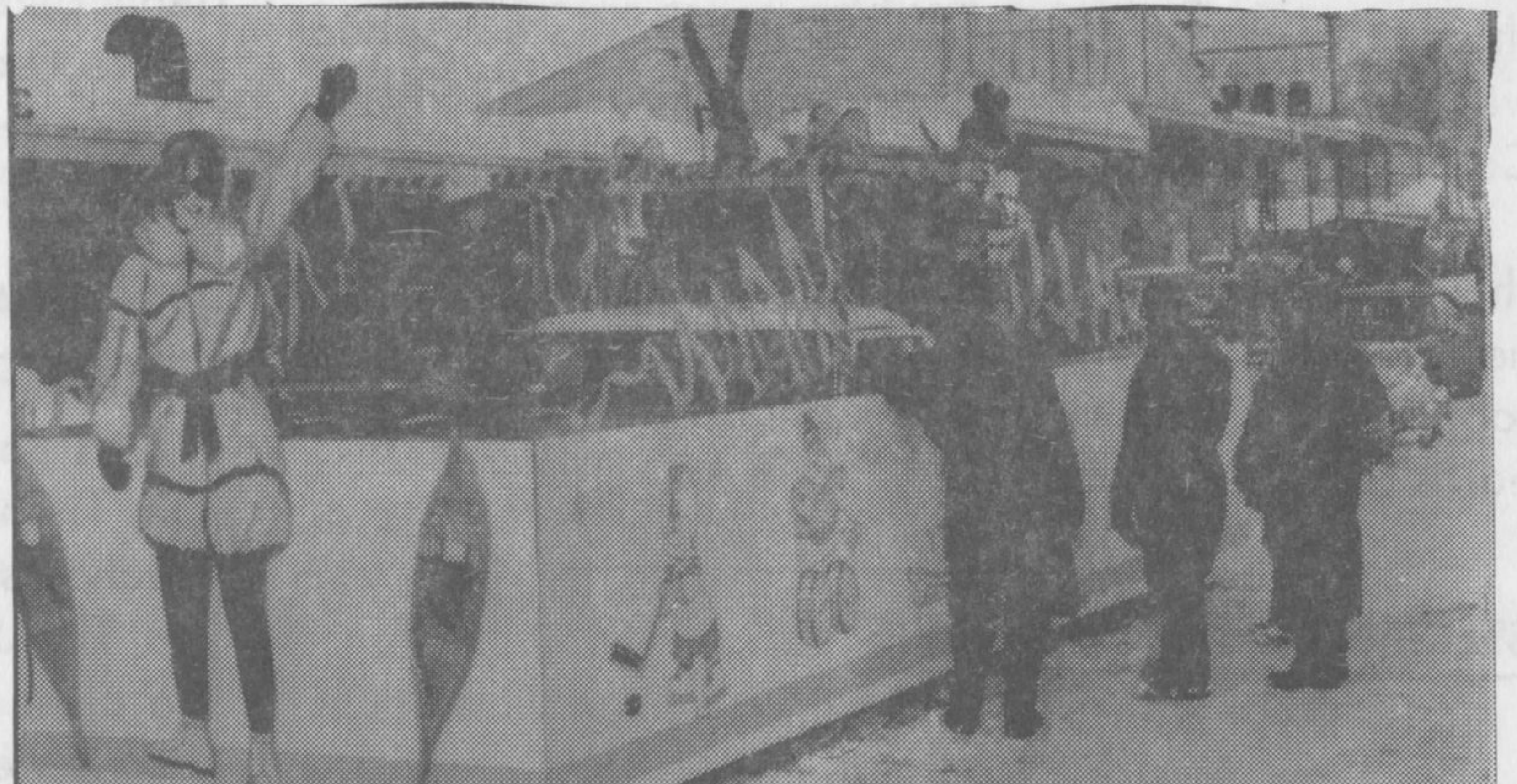
WINNING FLOAT in Carnival Parade sponsored by A. Mercure.