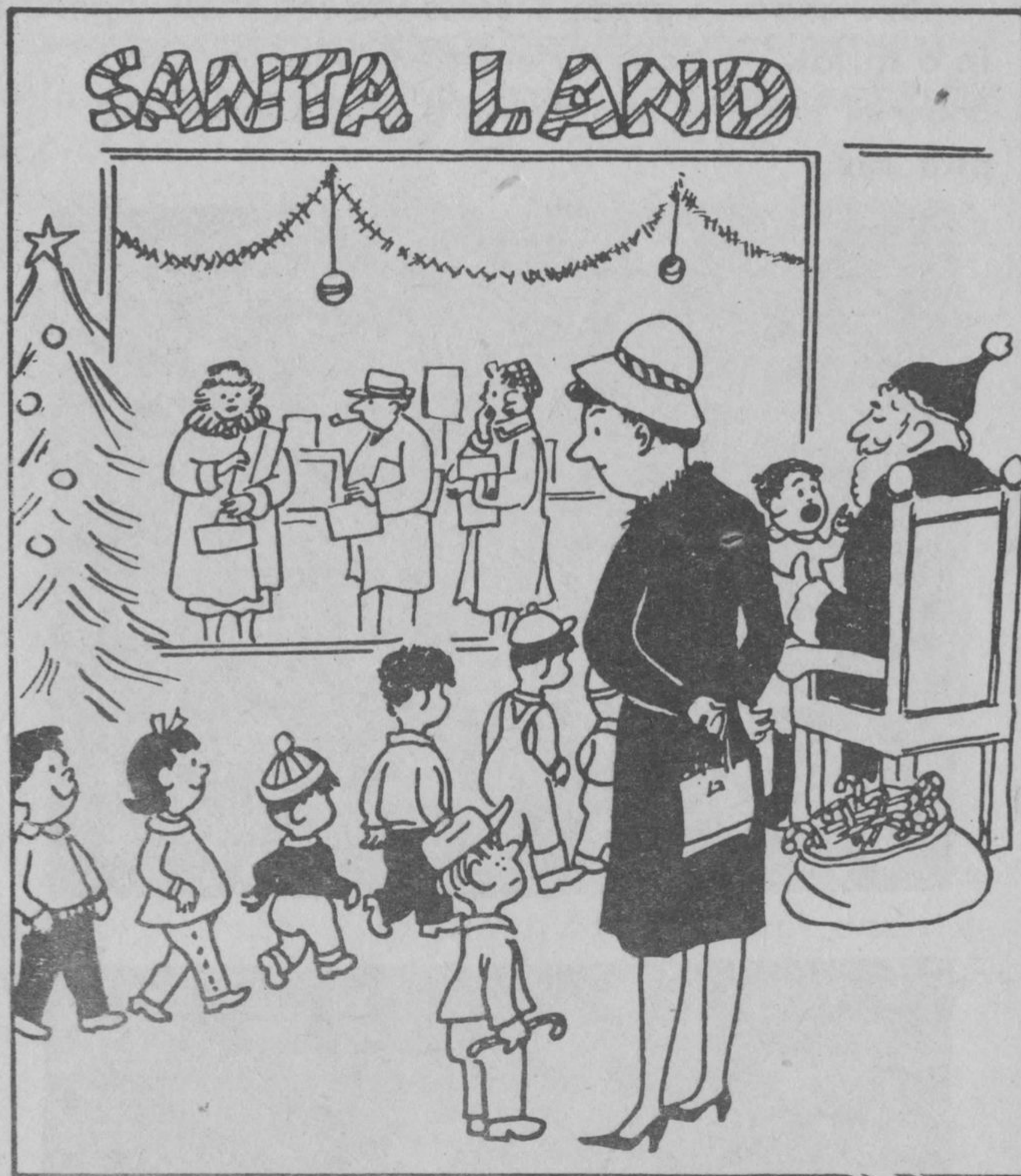
"It looks like Santa but it sounds like Grandpa . . ."