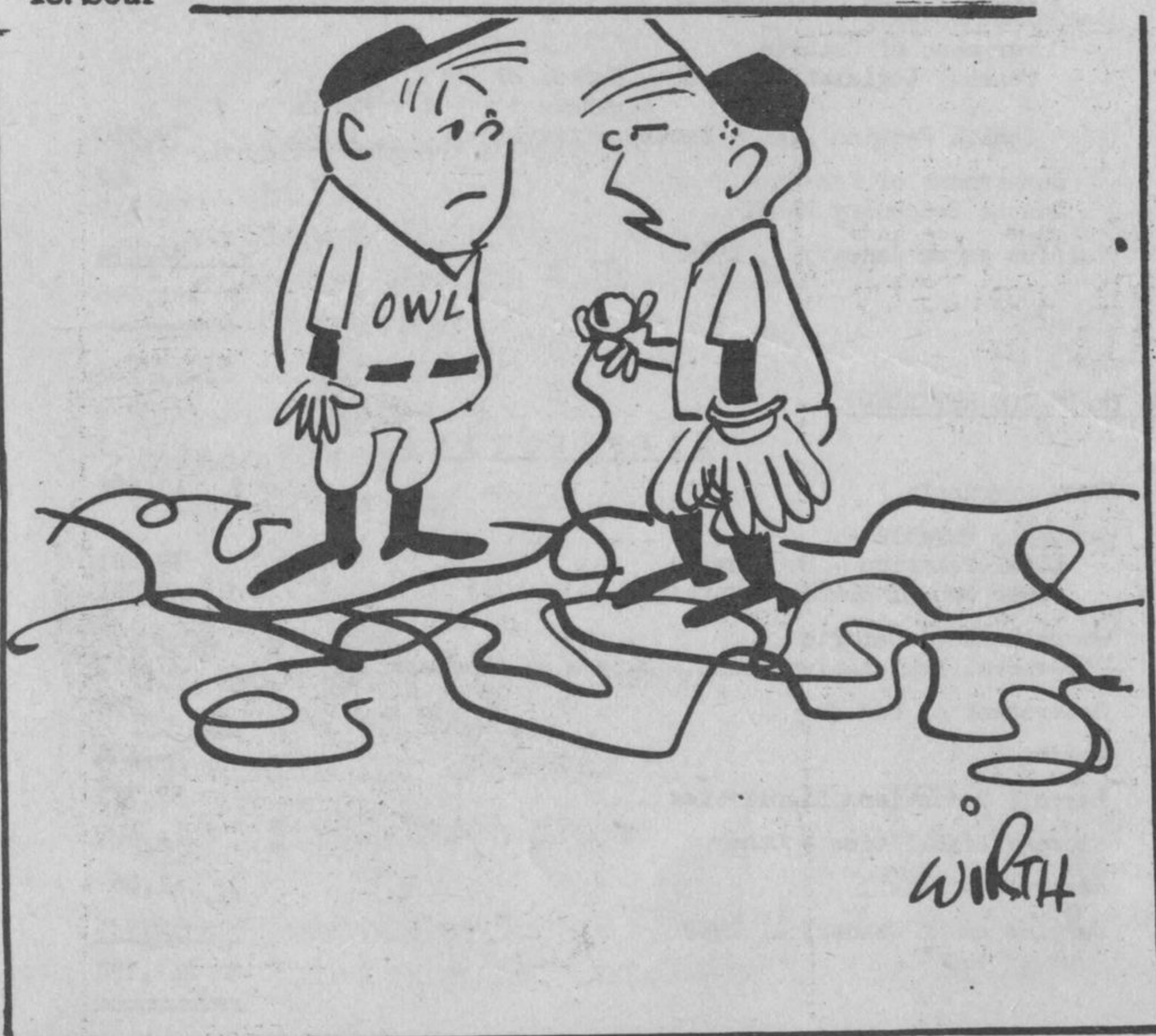
"I presume this was the first ball you ever taped?"