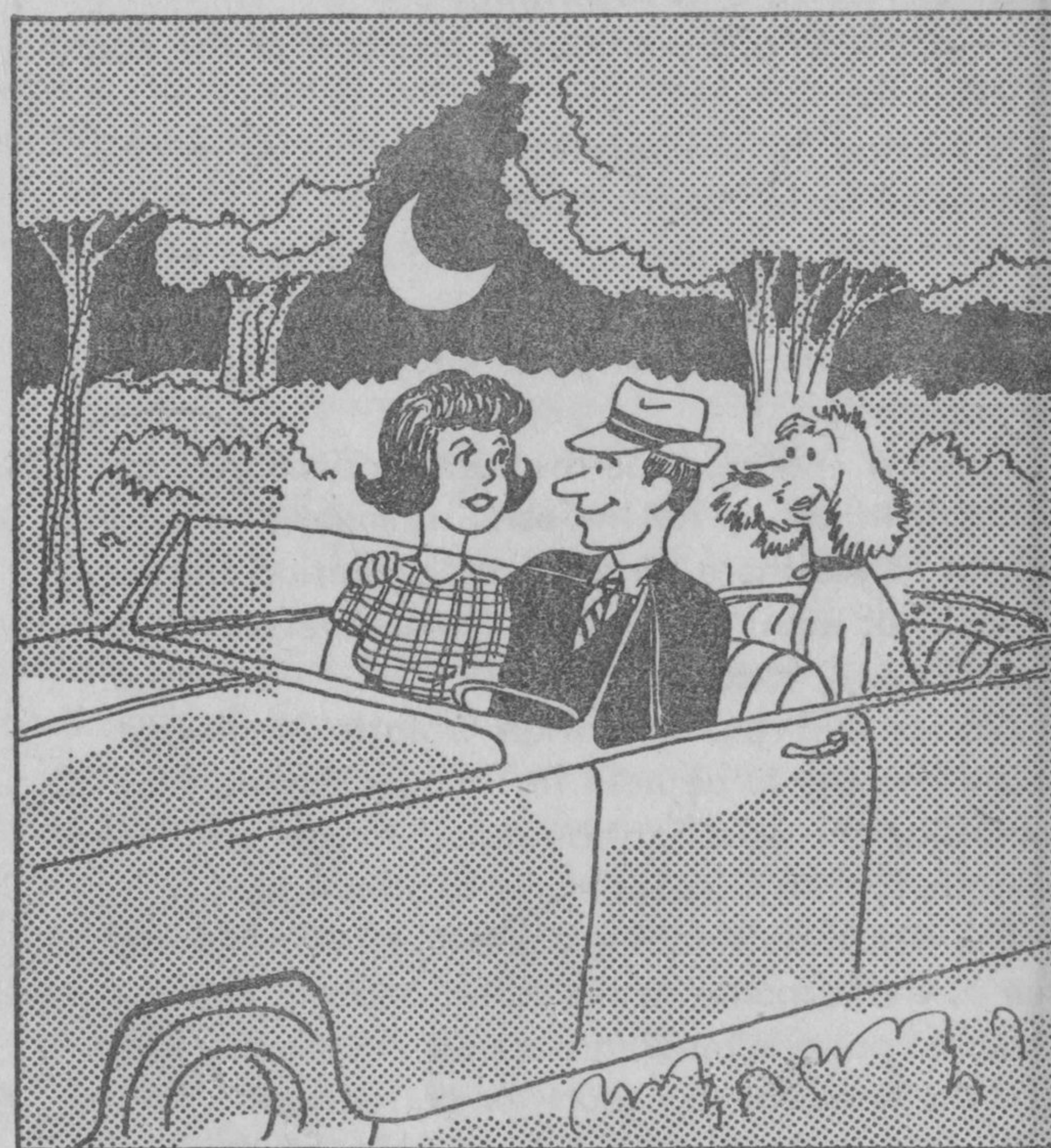
"I feel like someone is watching ..."