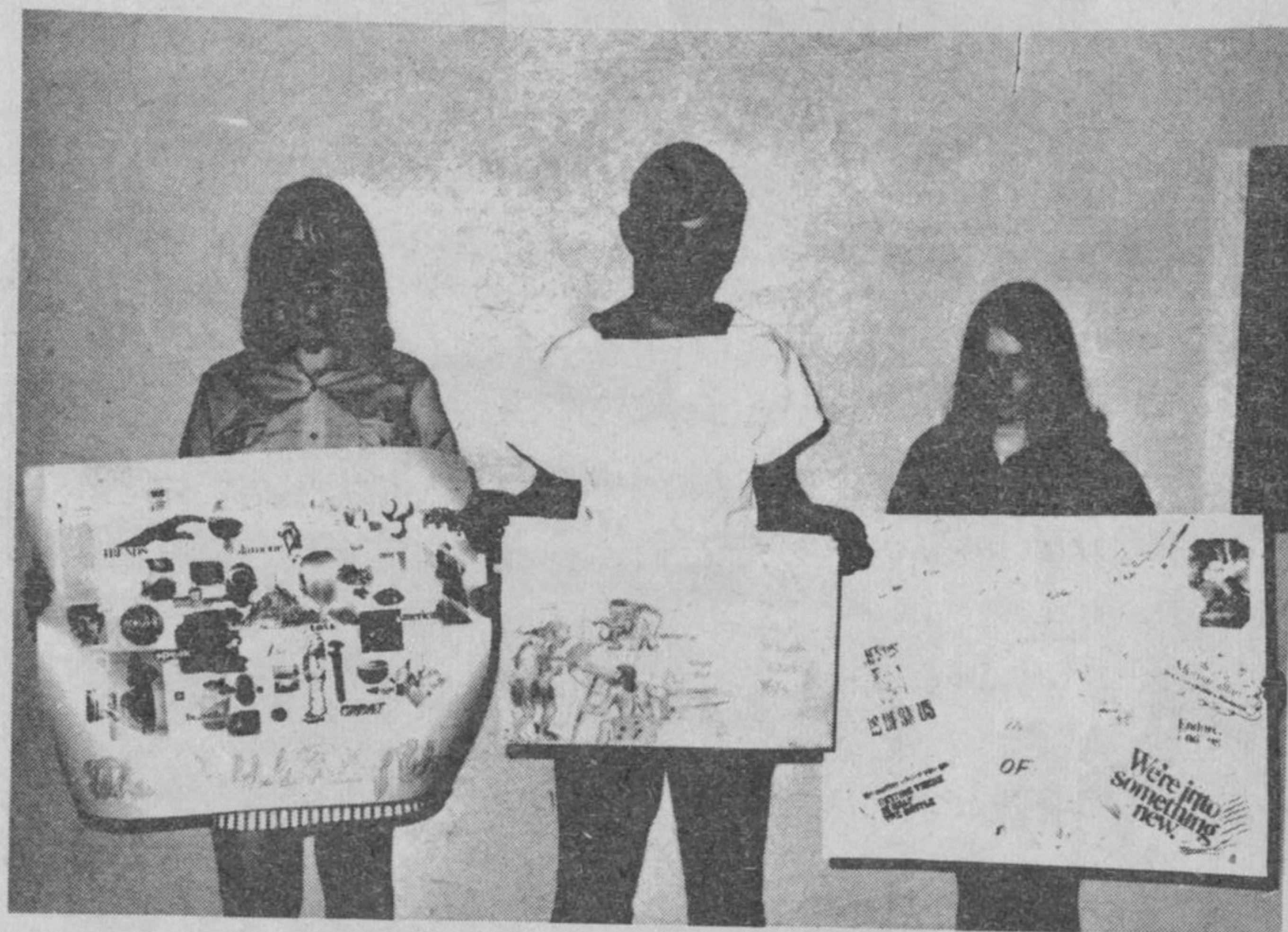
More Photos on Page 22 .....

FOR SALE - 15' Kenmac boat - 40 H.P. motor and electric start, control steering and windshield - trailer. Phone 824-2088.