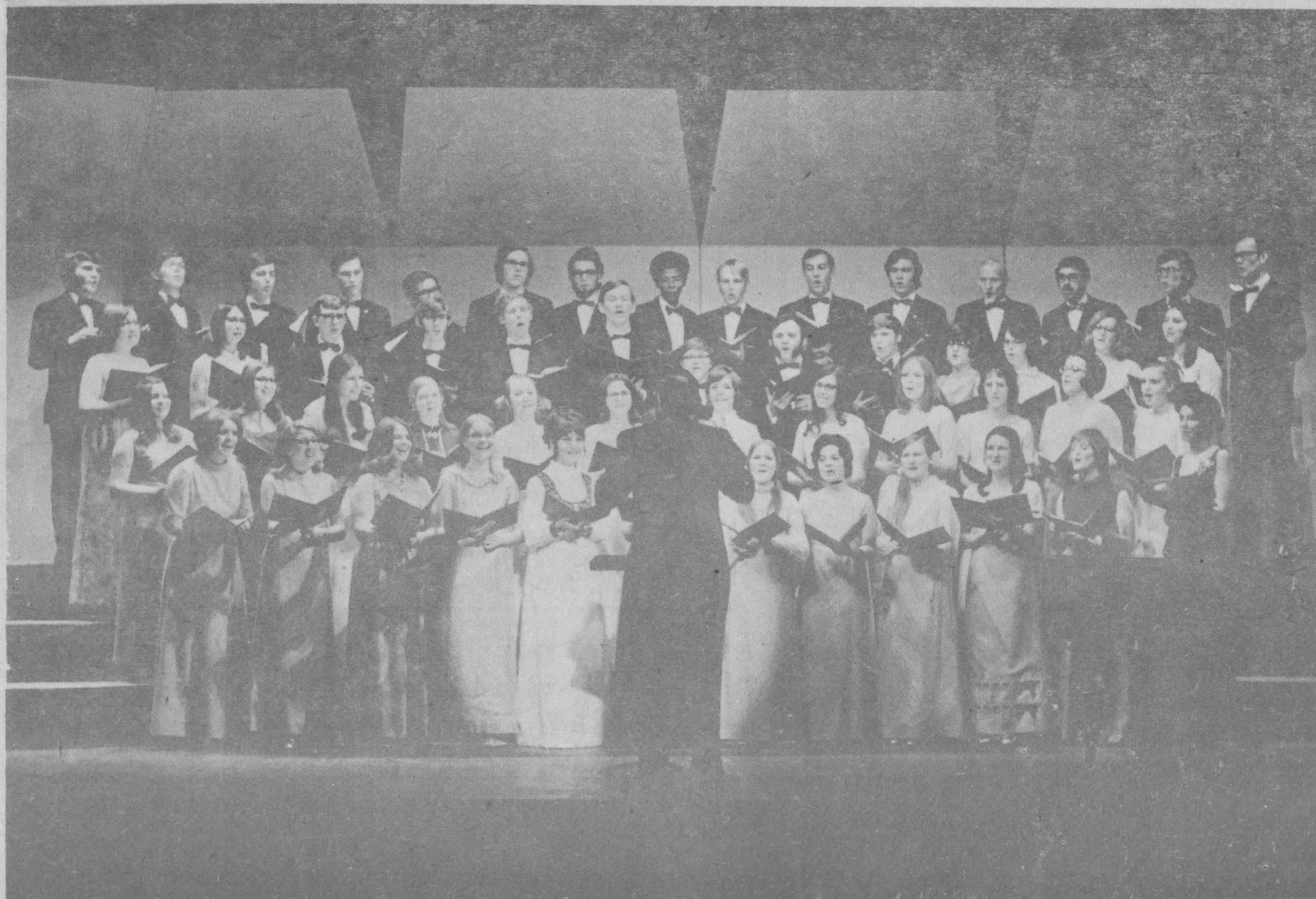
University of Western Ontario Choir, which will appear in Schreiber High School Auditorium, Tuesday, May 4th at 8:00 p.m.

Even after heavy rains, light forest fuels in exposed conditions can dry out in a few hours and become a fire hazard.