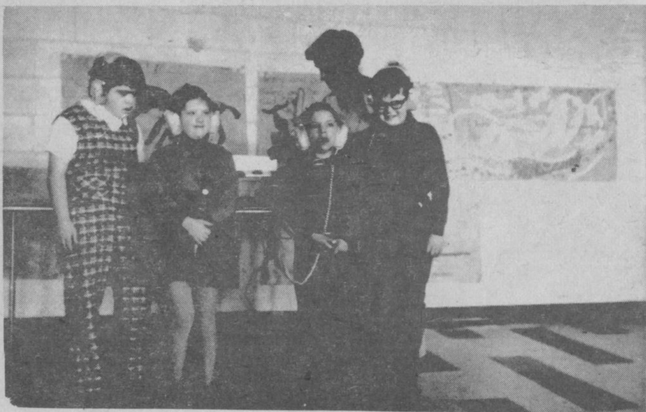
Photo Below - Students and Principal of the Caroline McMorland School for the Trainable Retarded, Marathon, demonstrating the Language Master.