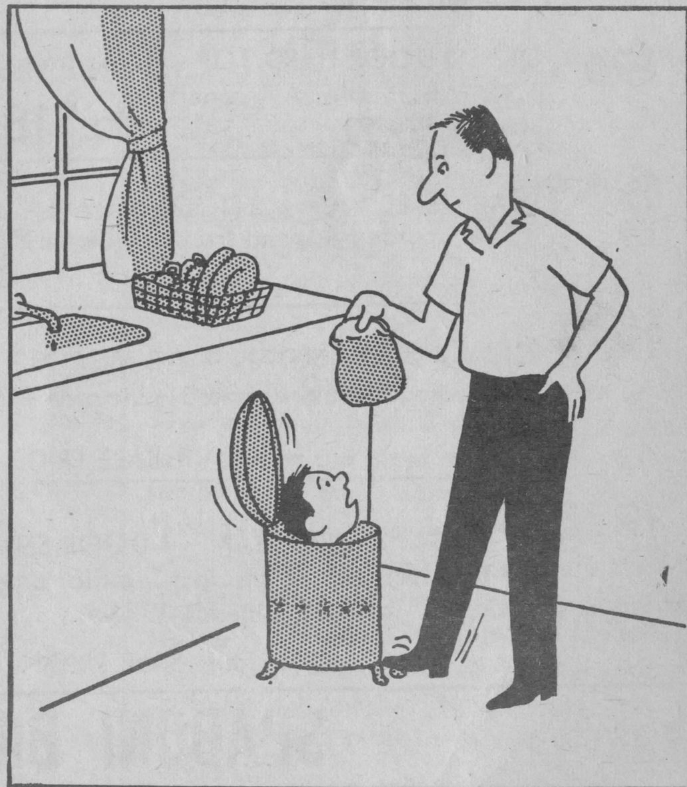
"Dad, you opened the space hatch ..."