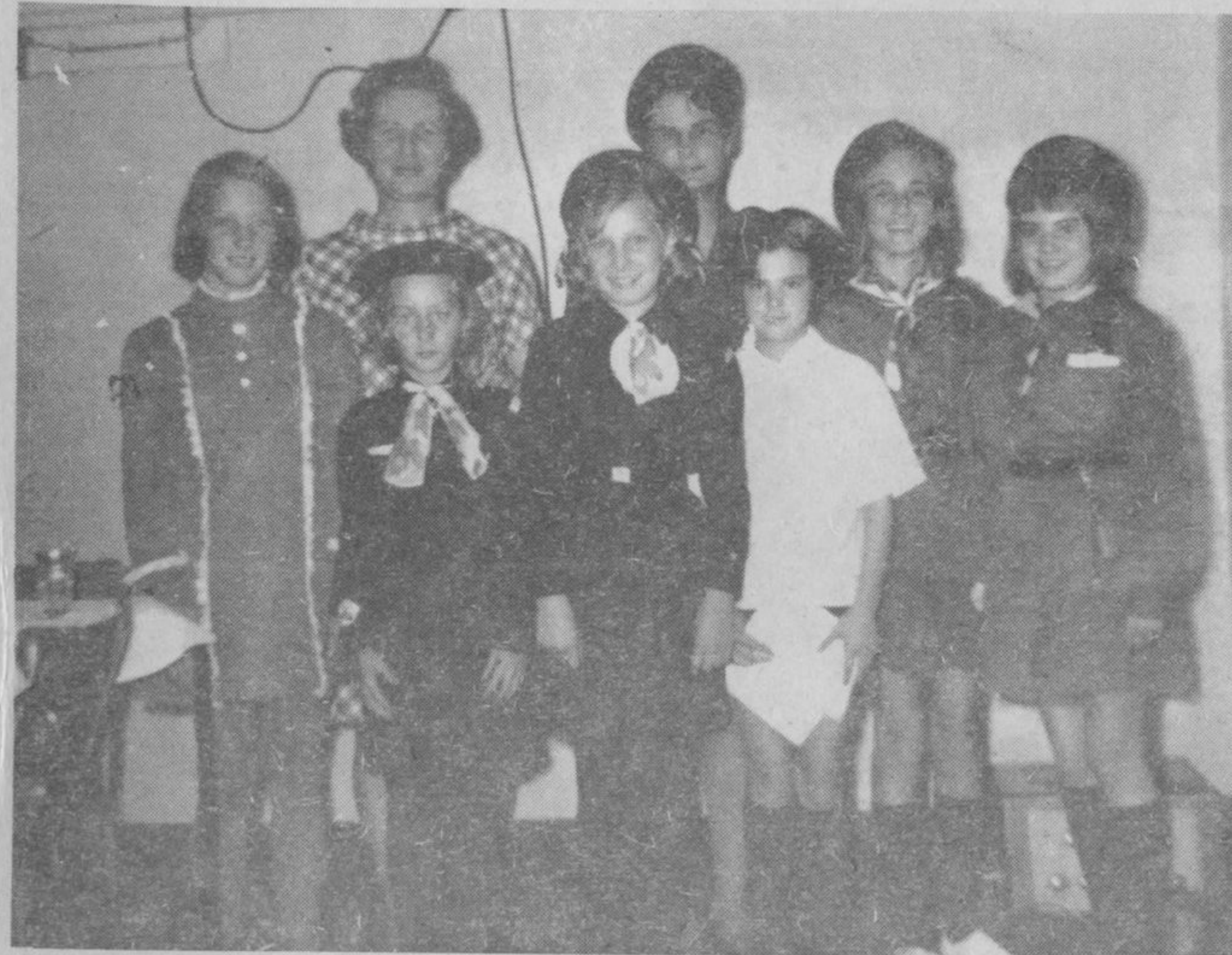
Guides and Brownies at Banquet.