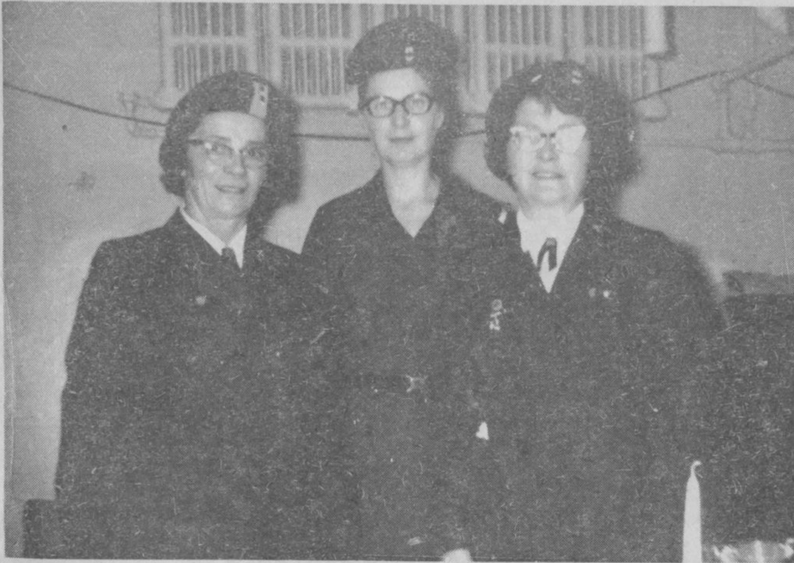
Officers at Guide and Brownie Banquet.