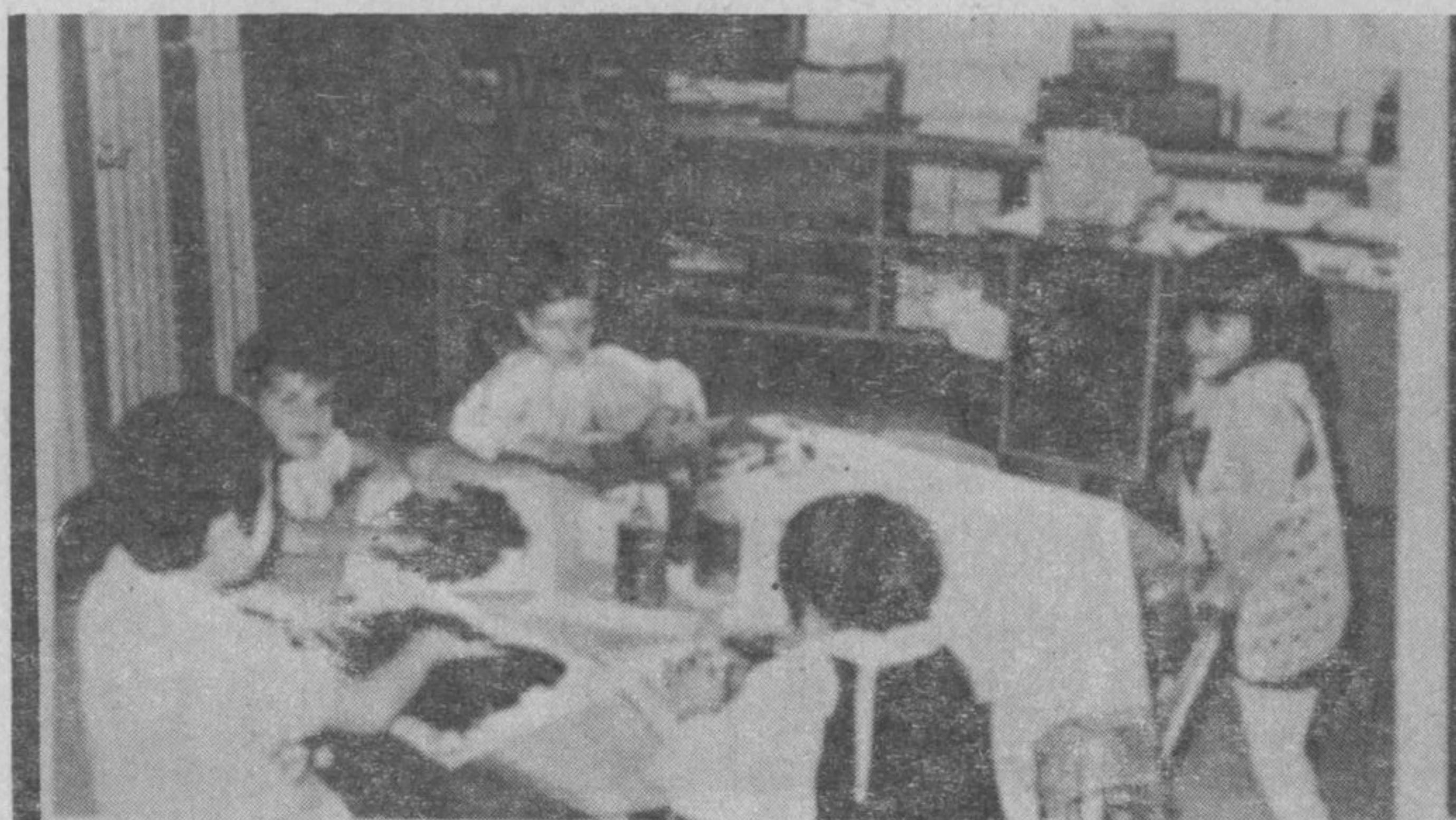
A group of Kindergarten children are shown using a form of finger painting. This media is at once enjoyable and an aid to self-expression and creativity.