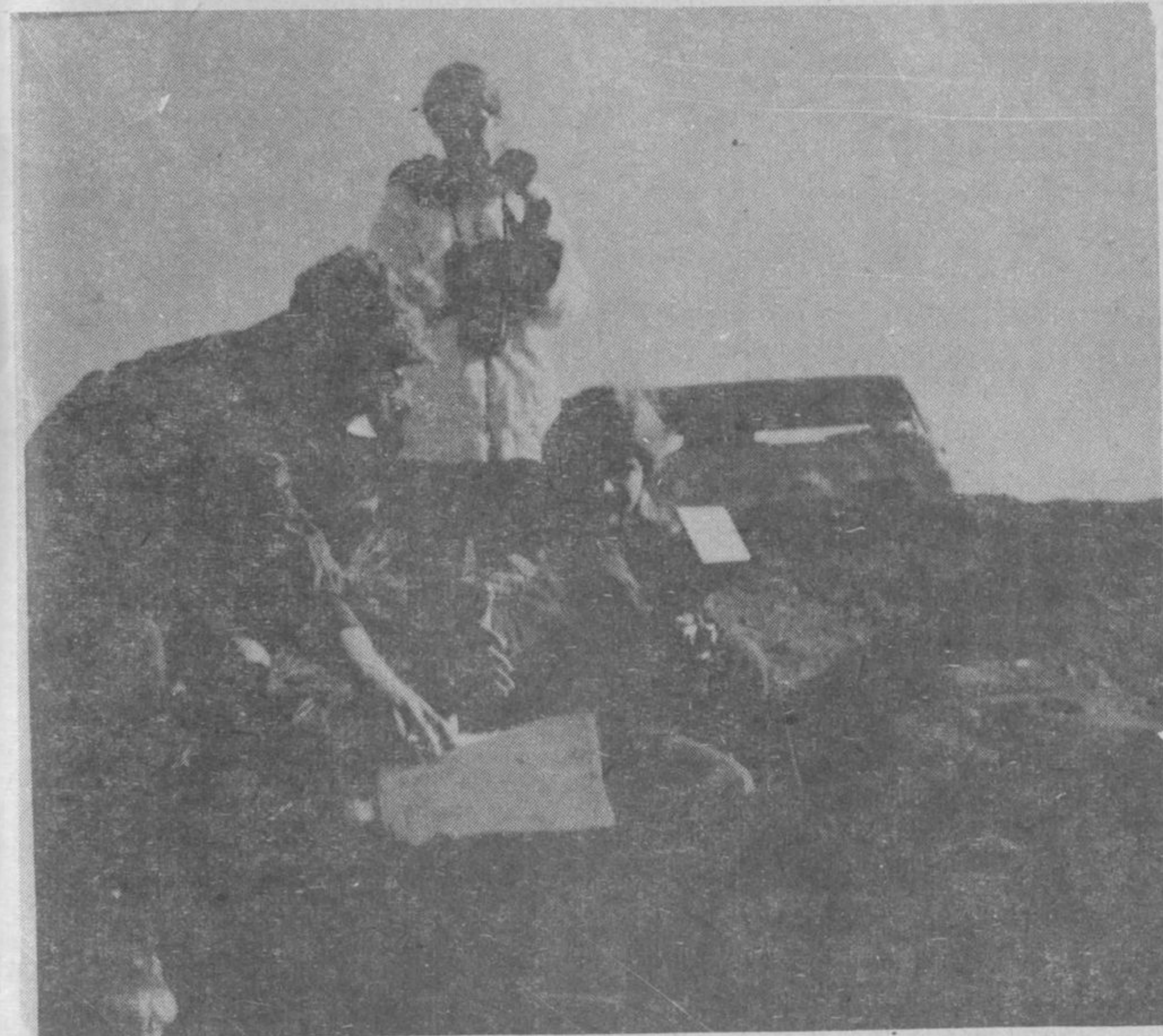
The color photos accompanying the article above have to be seen to be really appreciated. No captions were submitted.