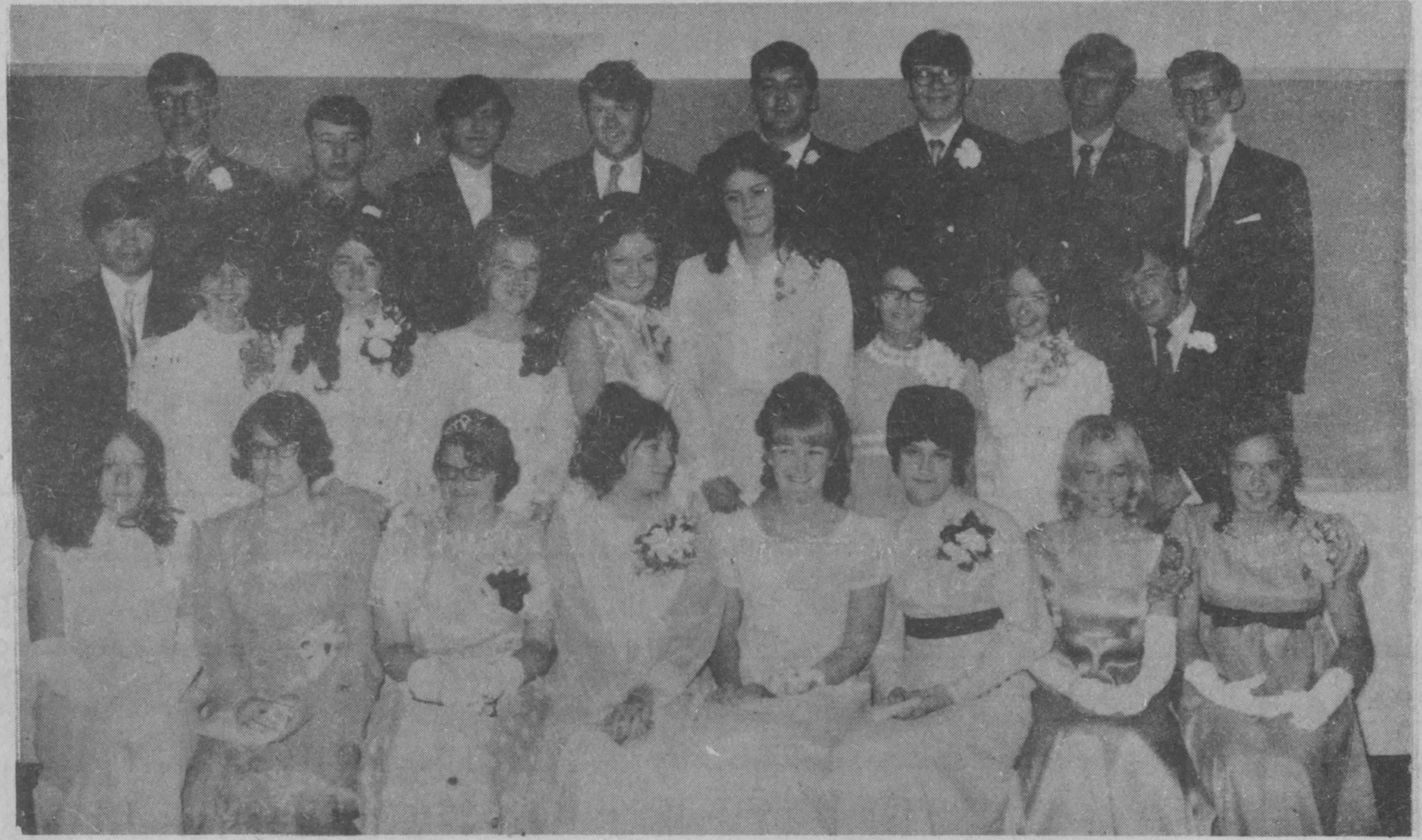
CRADE THIRTEEN CRADUATING CLASS - SCHREIBER HIGH SCHOOL