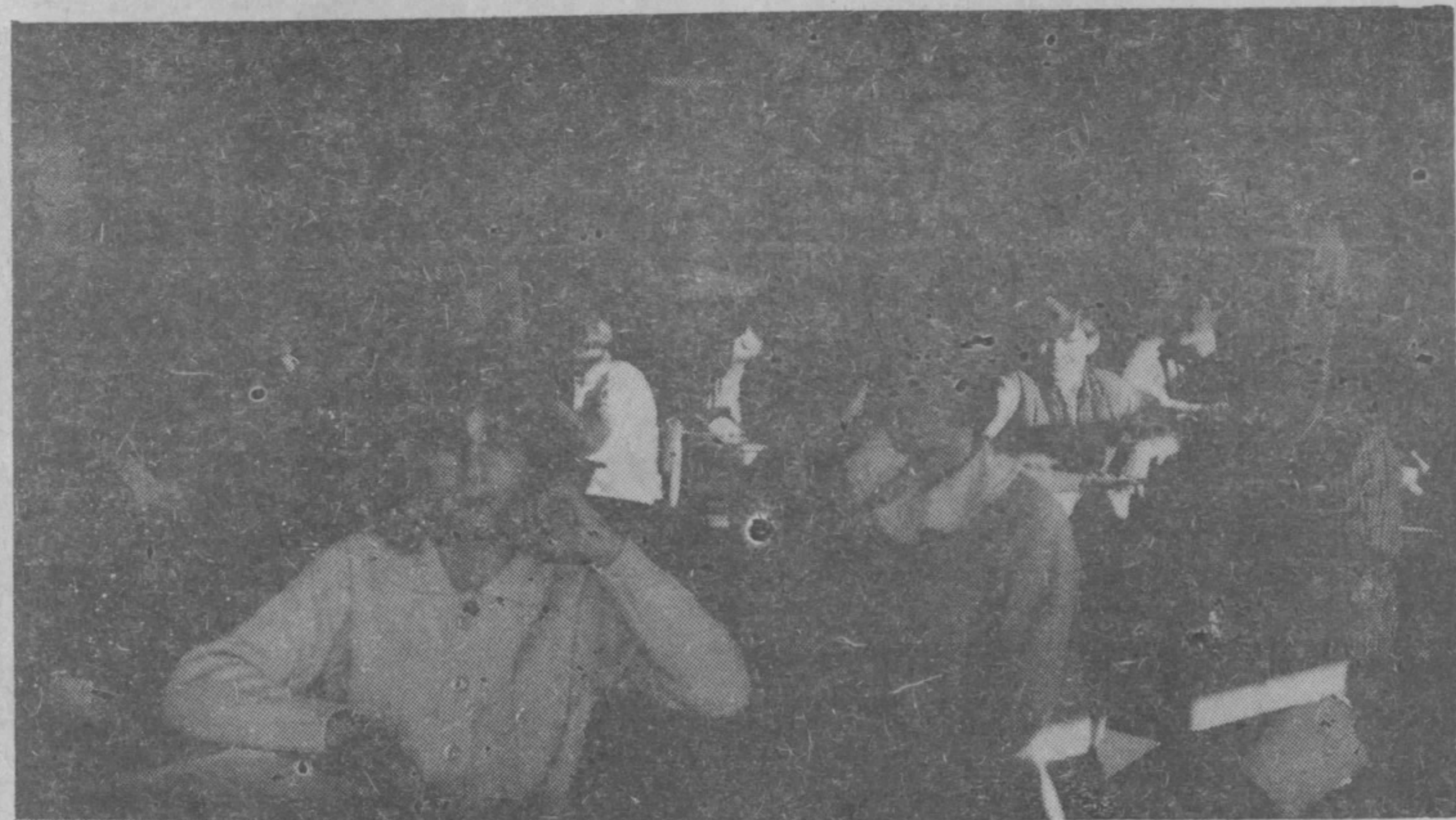
Photo above of the Grade 8 class, Schreiber Public School