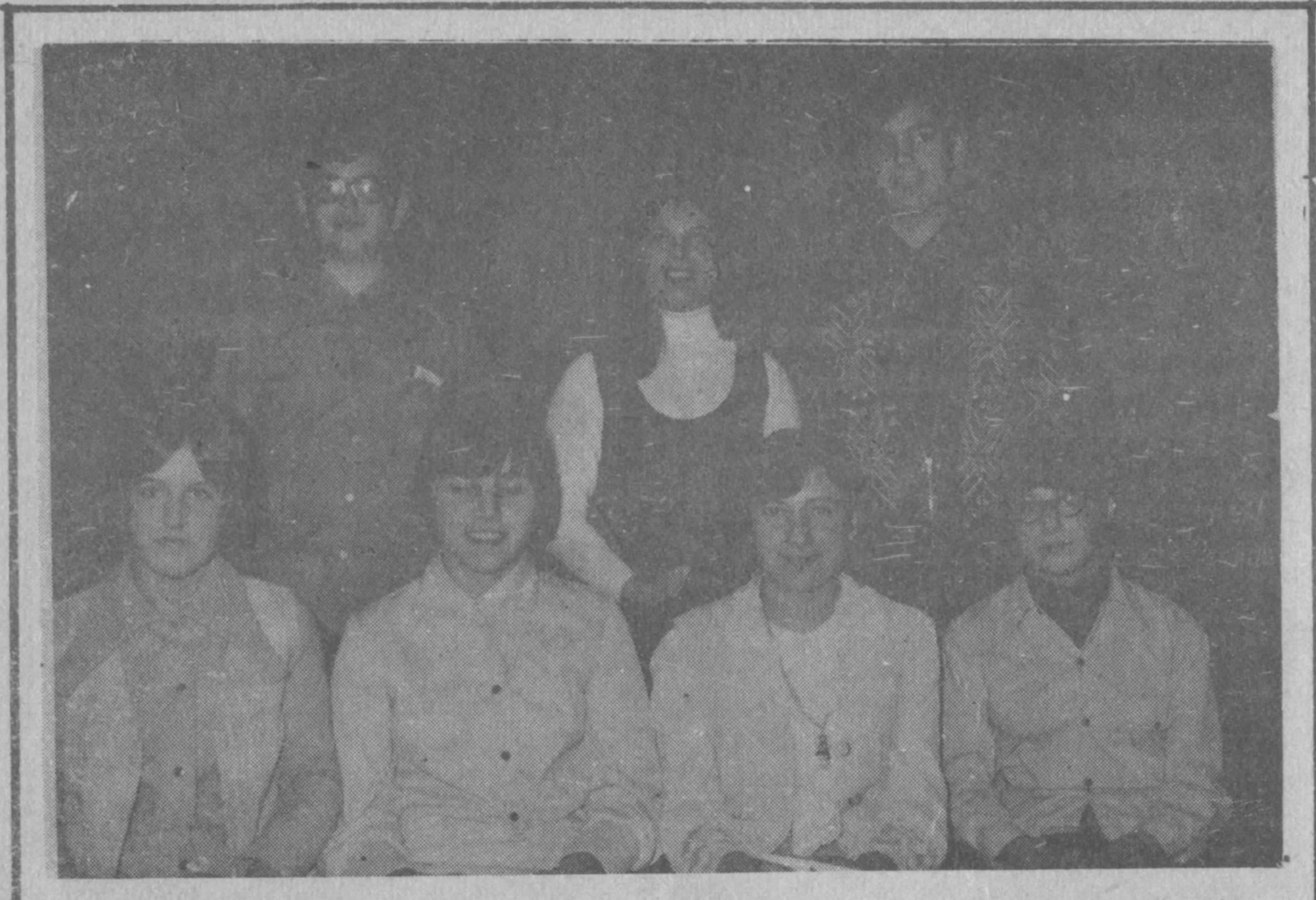
Photo above of the contestants in the Public Speaking Contest. See names page 13.