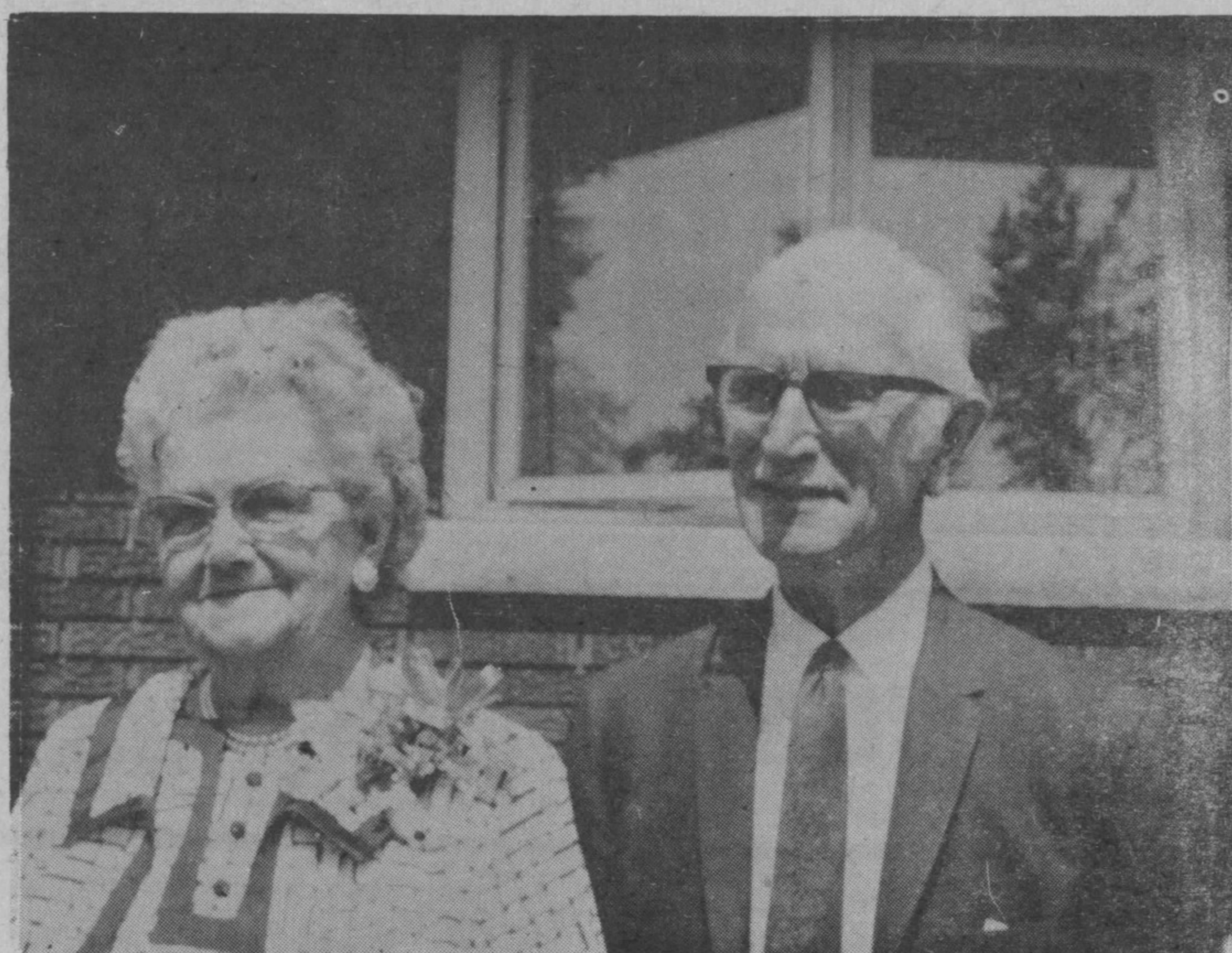
50TH ANNIVERSARY MARKED