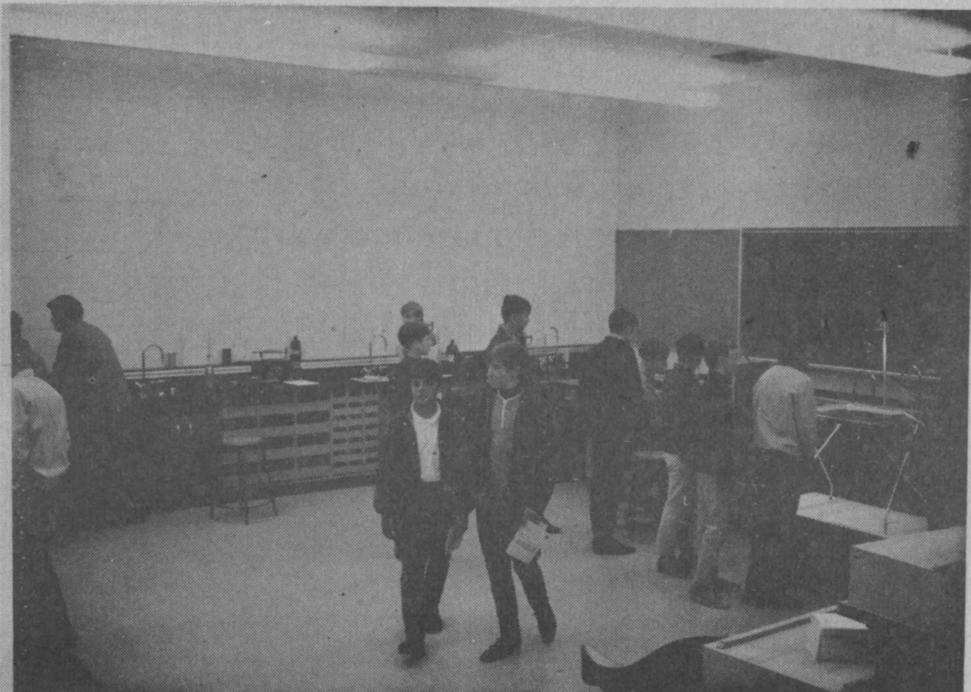
Photo above of the Science Room.