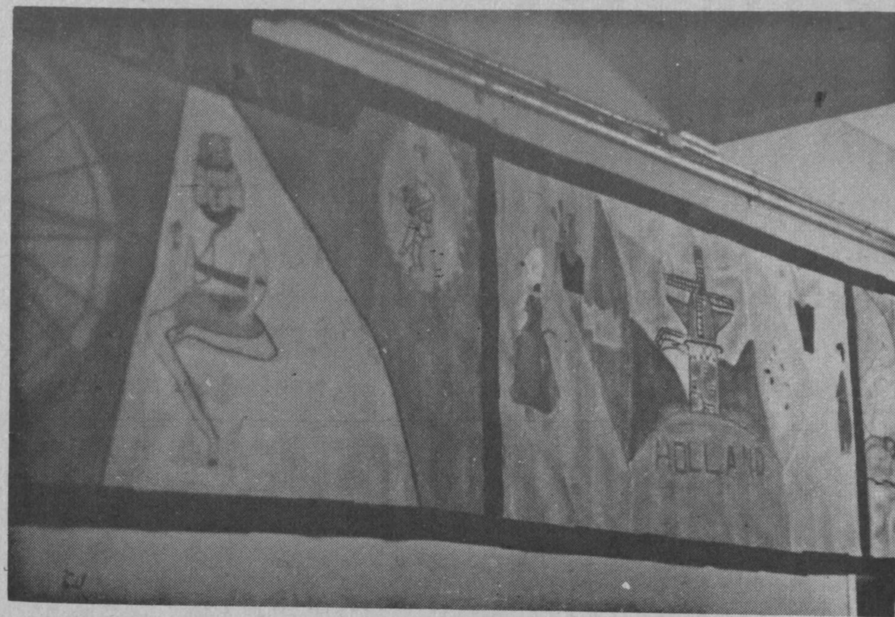
Mural photo continued from page 14.

motorists have had their car nearly demolished and ended up in the hospital after a collision.