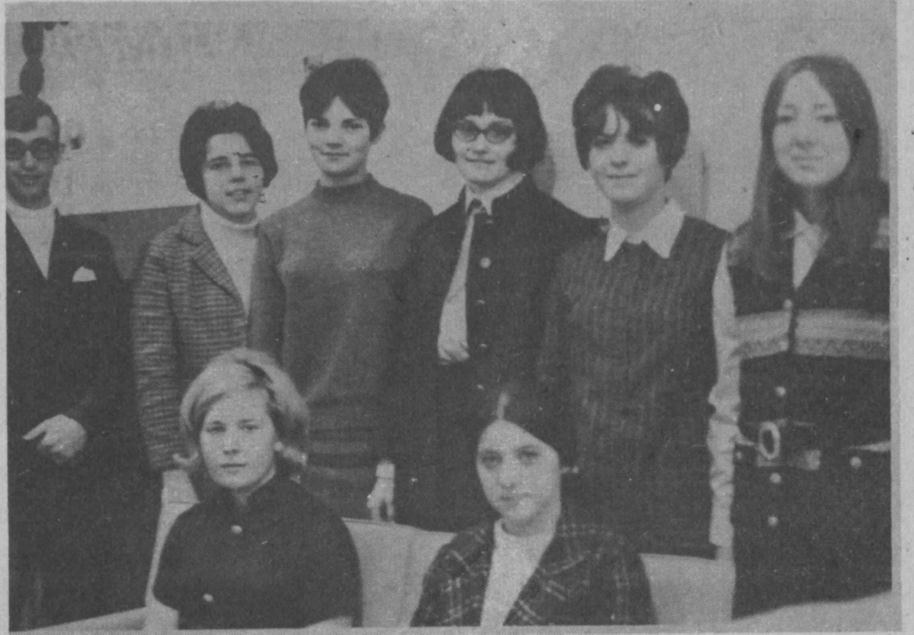
Photo above of some of the student teachers at Holy Angel's School.

On Friday, May 2nd these student teachers will be hired by the different School Boards in Ontario. Our School Board hopes to hire some of the best, to teach your children.