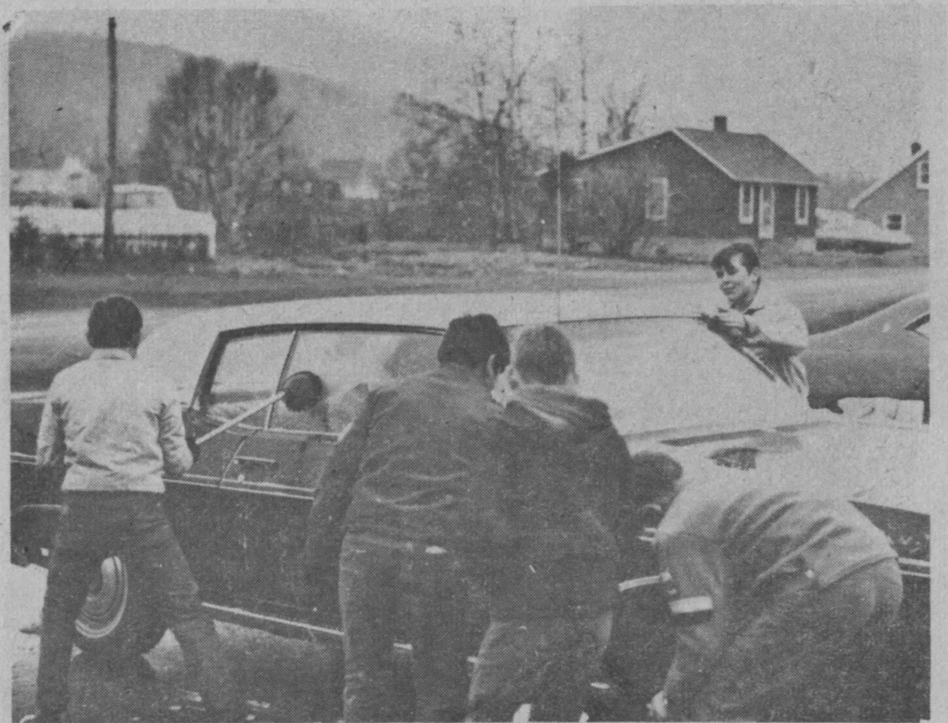
Photo above of grade eight students washing cars to raise funds for their June trip.