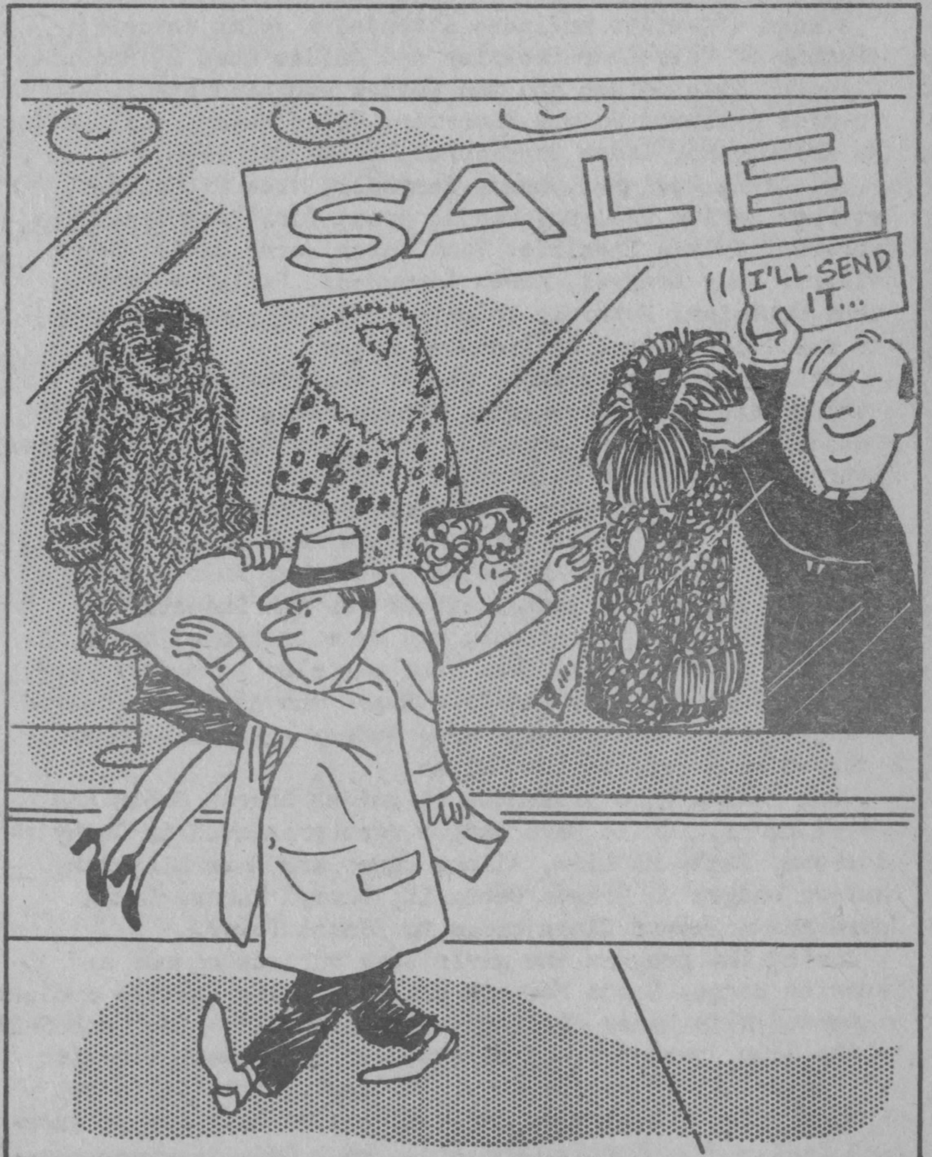
"No . . . you can't have that coat!"