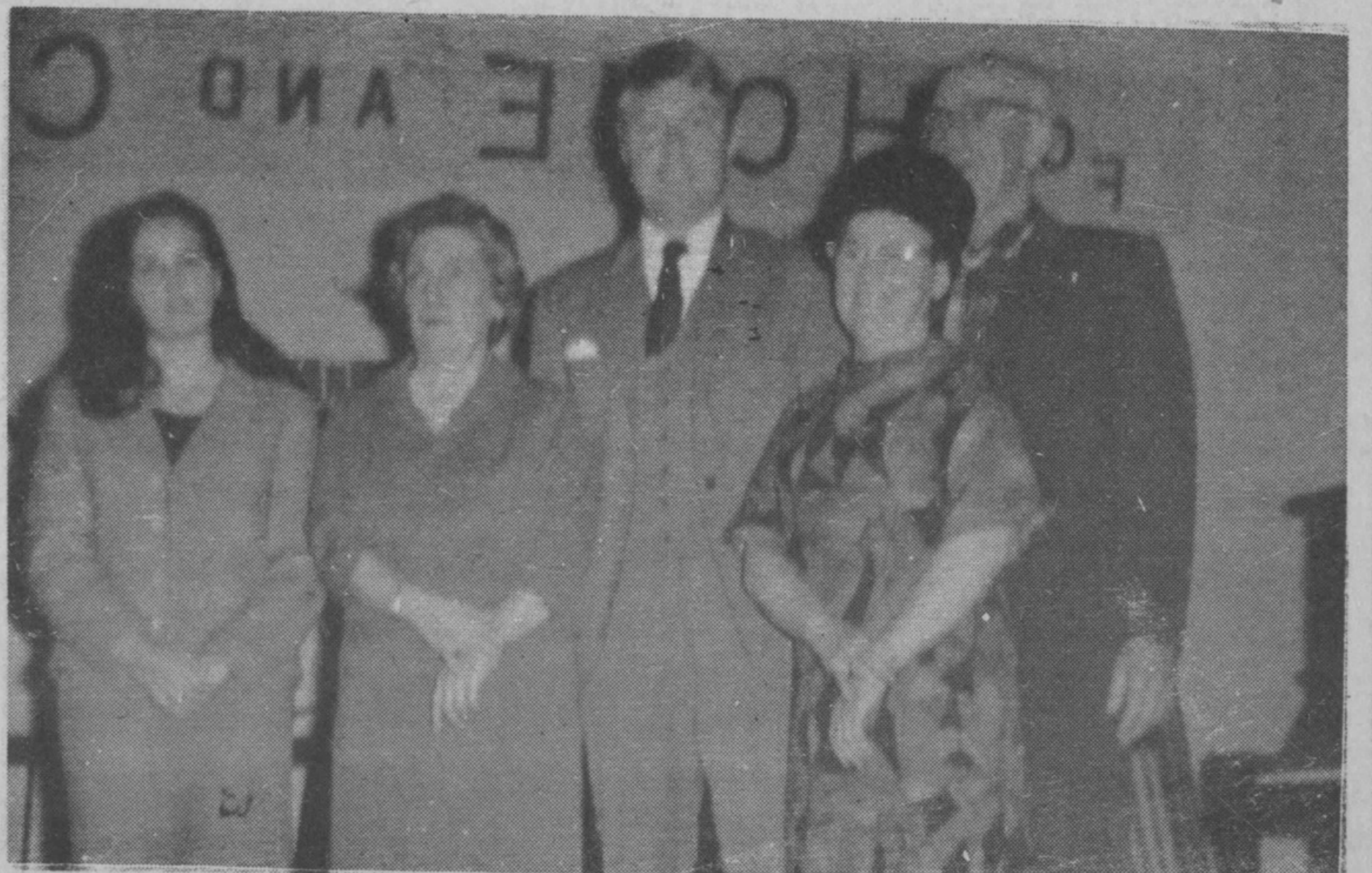
Shown below are the judges for the Rossport Masquarade ball.