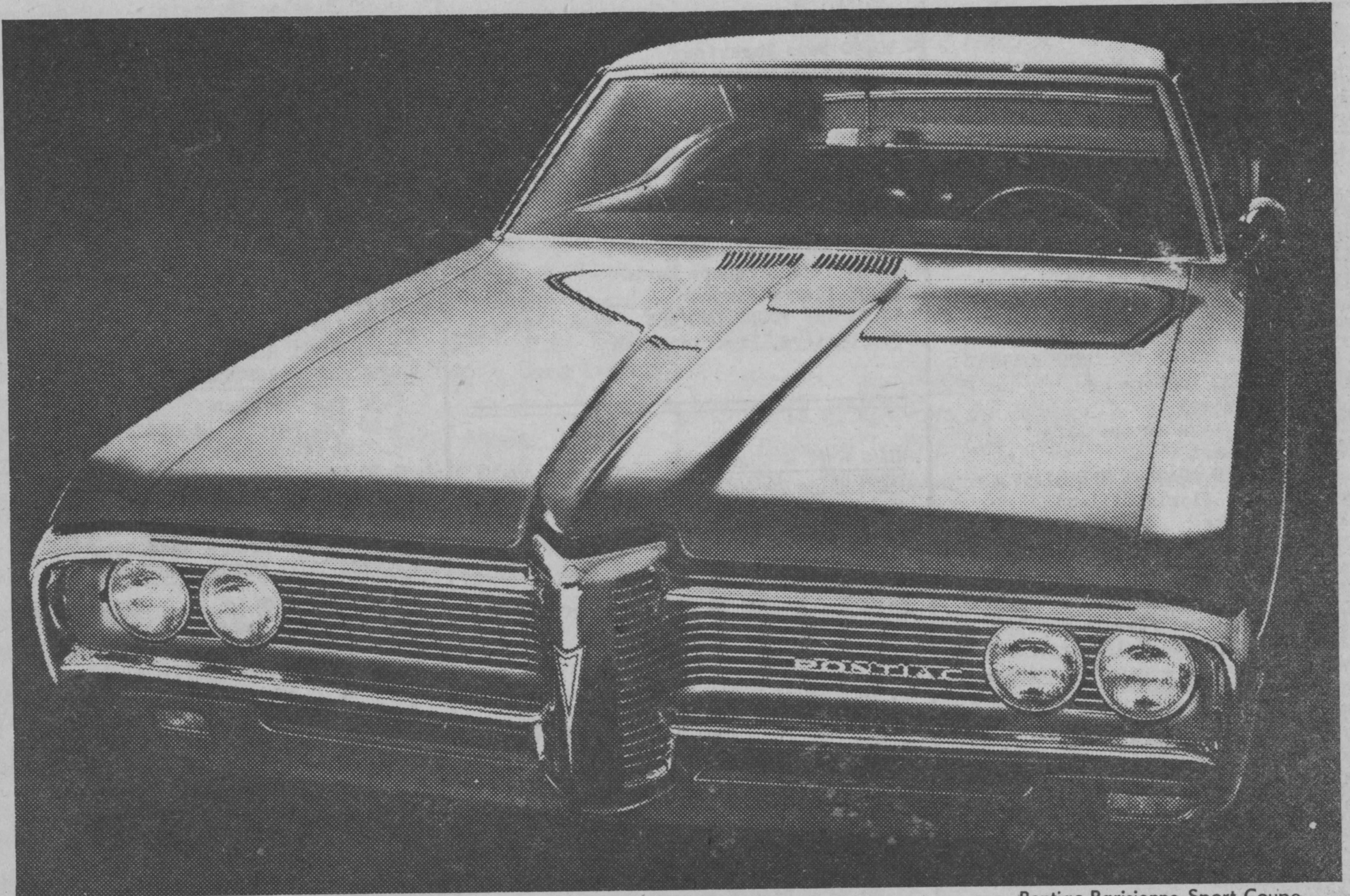
Pontiac Parisienne Sport Coupe

One of the joys of Wide-Tracking in a Pontiac is that it doesn't cost any more than ordinary driving. And with 24 Pontiac models, you can choose your own style of Wide-Tracking. If you're settling for less than Pontiac's exclusive Wide-Track Ride and its standard 250 cu.-in. six or 327 cu.-in. V8, stop settling. Start Wide-Tracking. The drive is on. See your Pontiac dealer. Wide-Track Pontiac