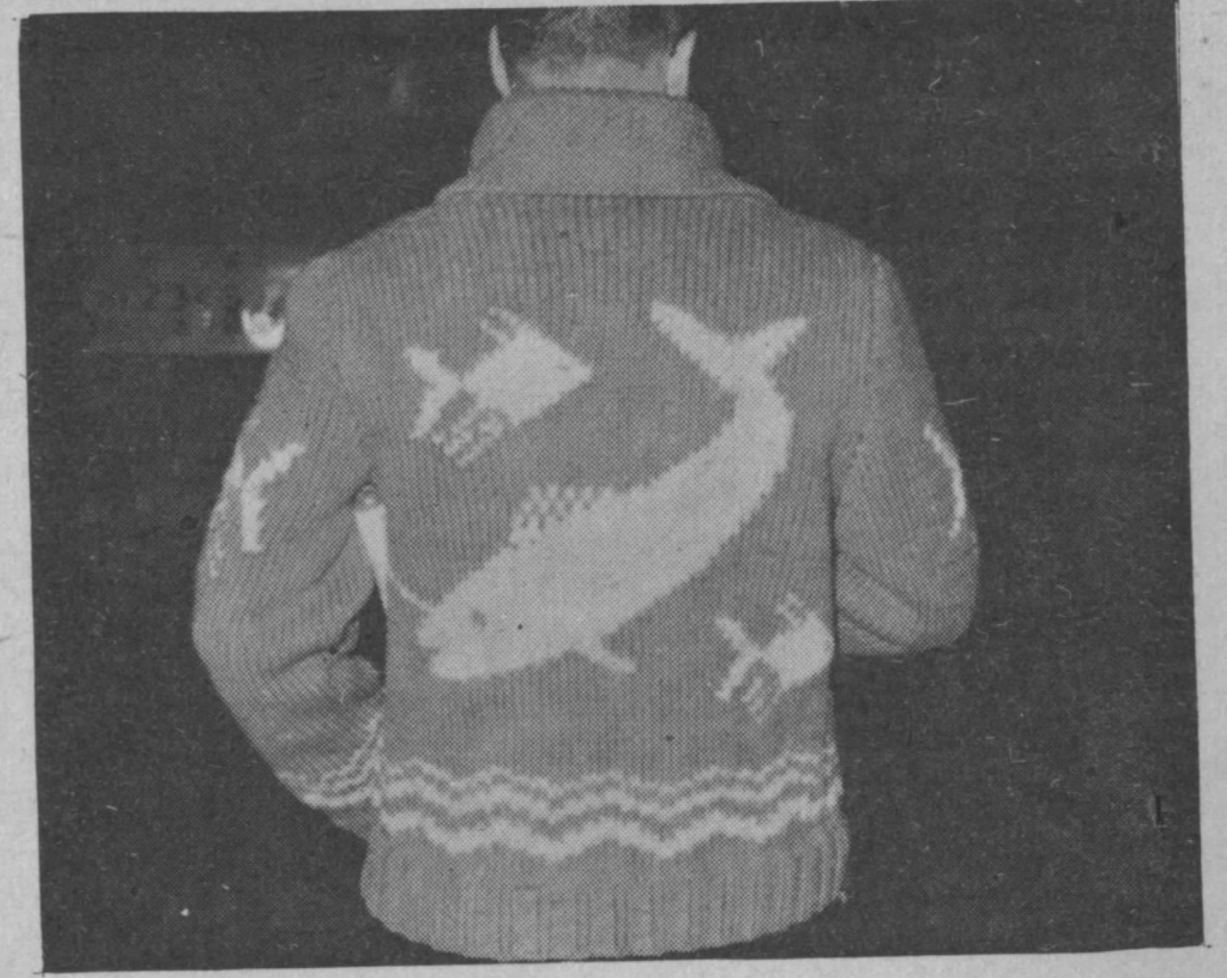
A "BIG ONE" THAT DIDN'T GET AWAY! Your roving reporter thought the sweater worn by a member of the rink which represents Schreiber in the O'Keefe Competition is a good advertisement for our district.