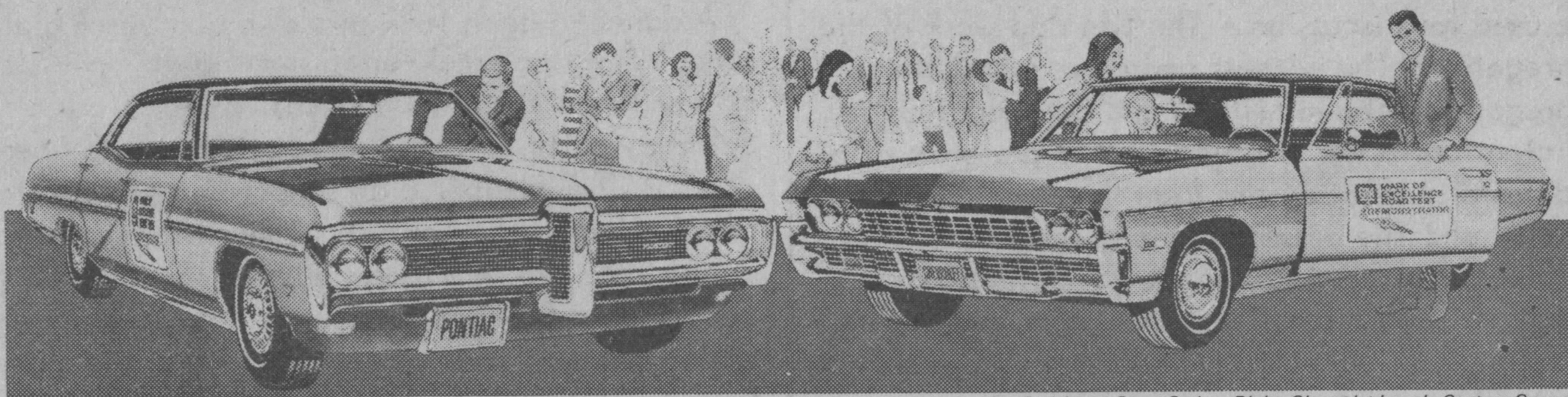
Left: Pontiac Parisienne Sport Sedan. Right: Chevrolet Impala Custom Coupe.

GENERAL MOTORS DEALERS INVITE YOU to test drive the only cars that bear the Mark of Excellence. See, hear, and feel for yourself GM's margin of superiority over the other 1968 cars. Driving is believing! Come in today! Your test car is waiting.