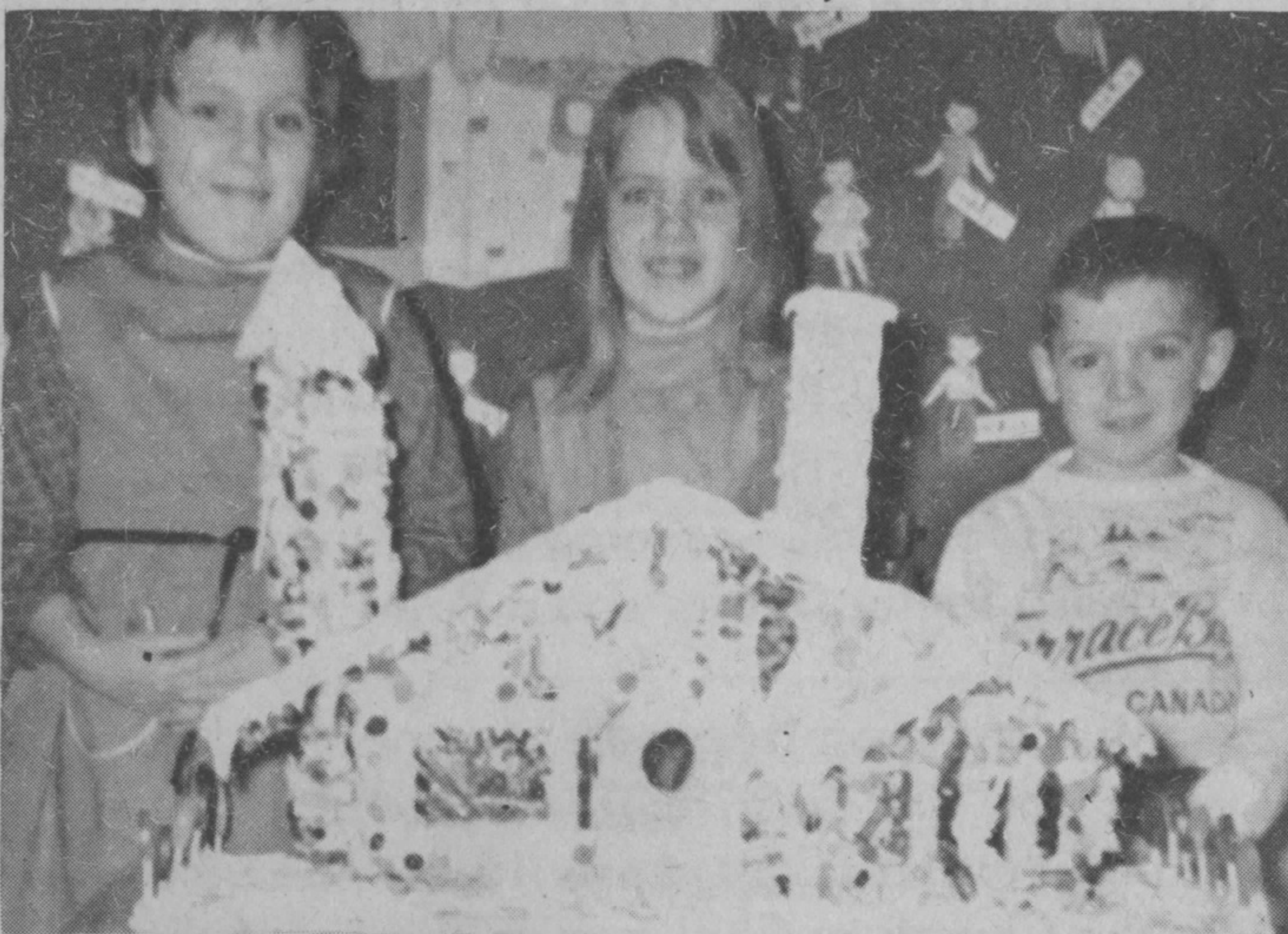
The picture above by M. Lundberg, shows the three McBride children displaying the house made out of edible delights. Children from Terrace Bay Public School Kindergarten, and grades 2 and 3 made the house out of cookies, cake and nine egg whites, with twinkle lights inside and around the roof.