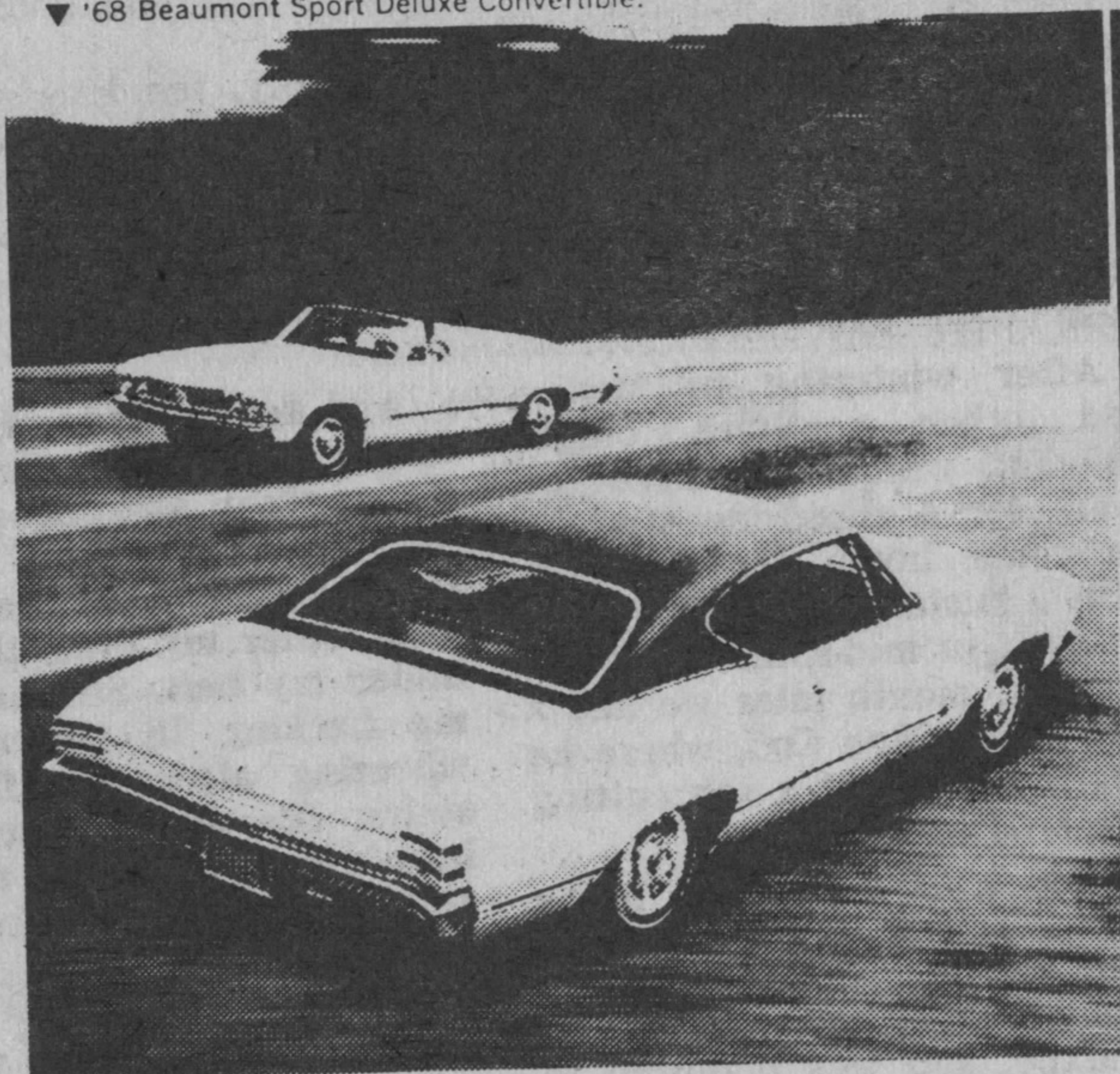
▲ '68 Beaumont Sport Deluxe Sport Coupe.