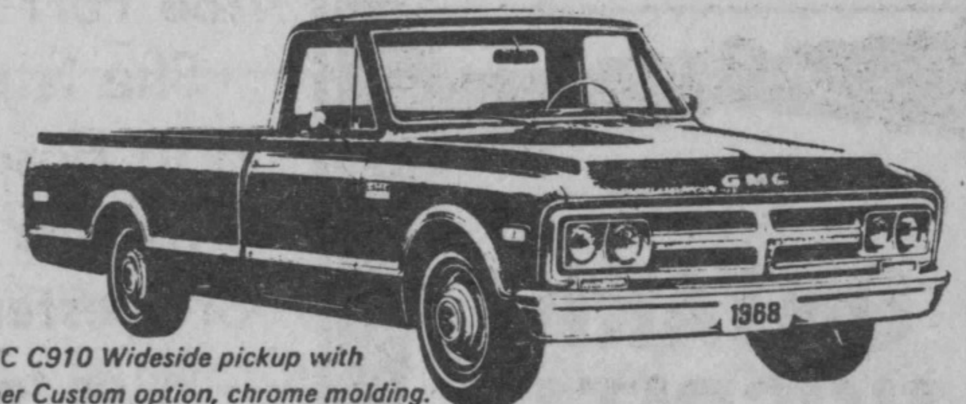
GMC C910 Wideside pickup with Super Custom option, chrome molding.