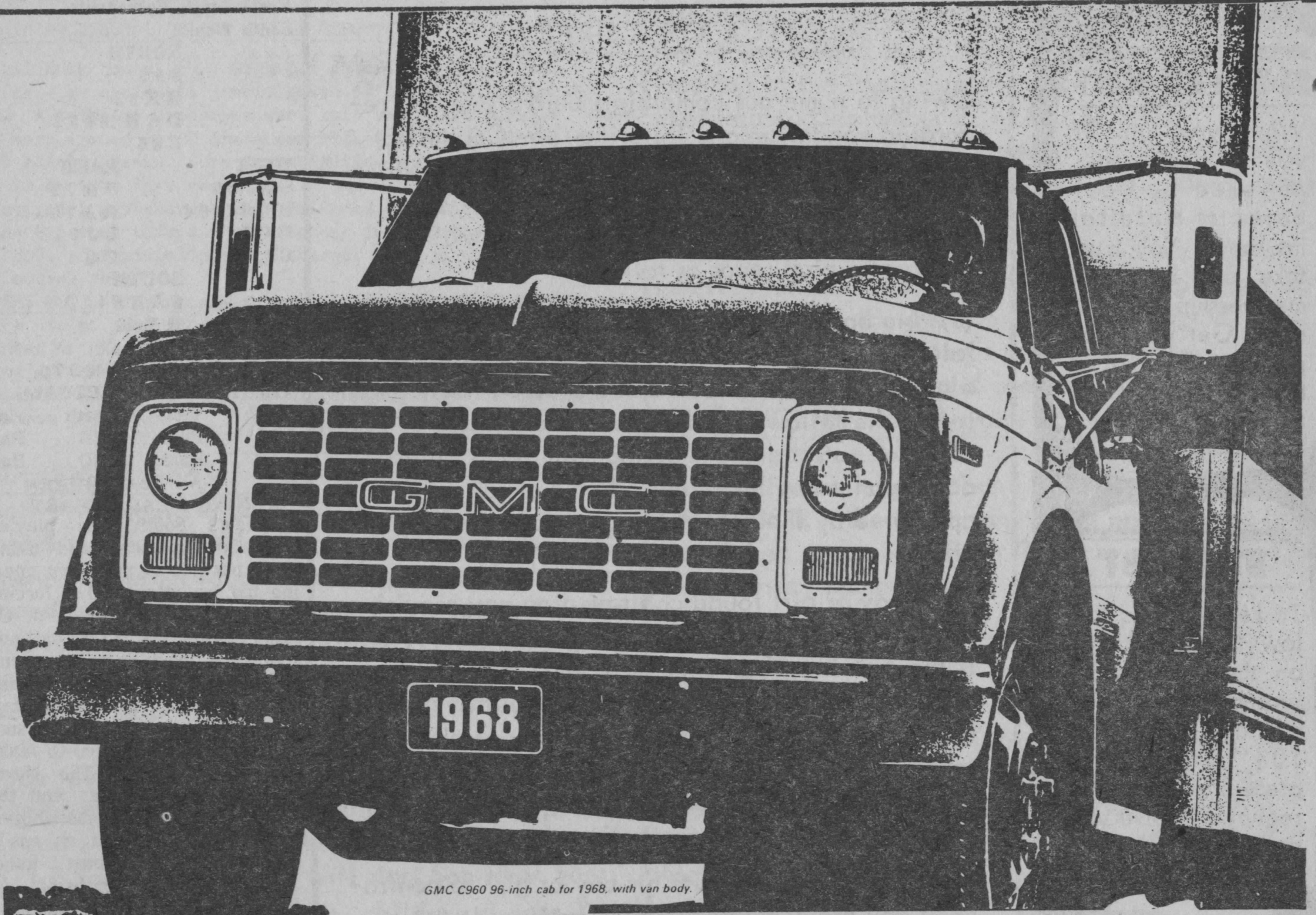
GMC C960 96-inch cab for 1968, with van body.