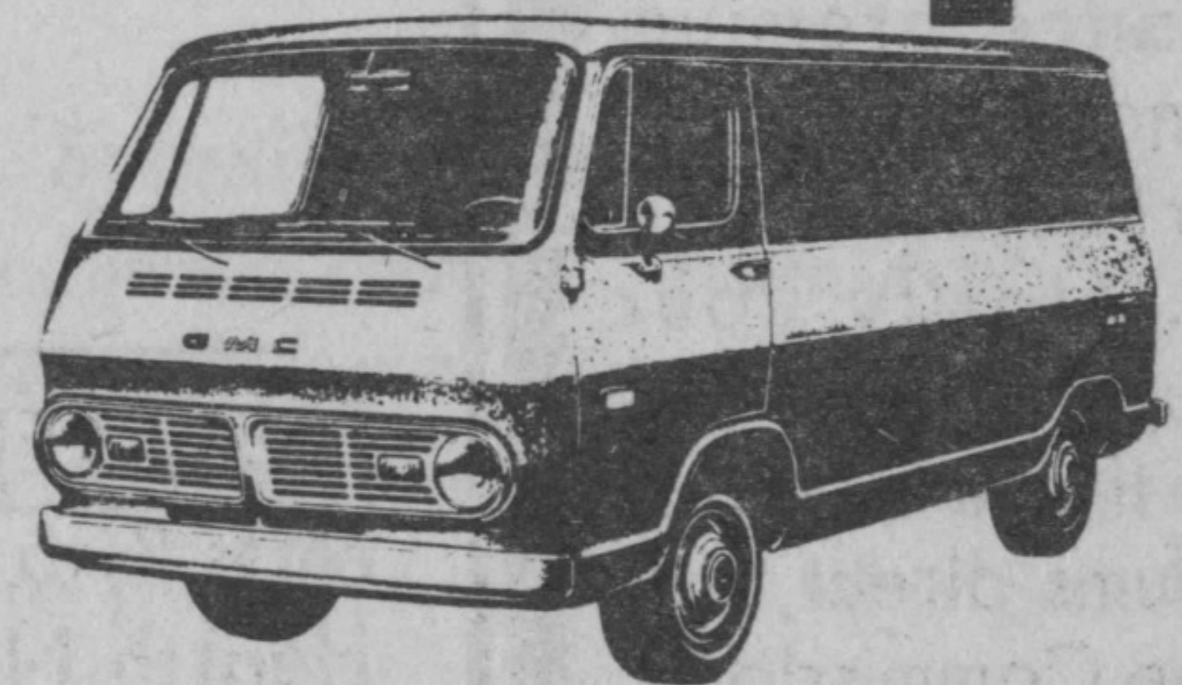
GMC 108-inch-wheelbase Handi-Van.

brand new 307-cu.-in. with 200 hp! Other light duty extra-cost options you can order are the 327 and 396 V8s. The 307 V8 is also available on Handi-Vans and on the all-new Value Vans. This is why GMCs are the 'Powered Up' trucks for '68. And it's why you should get right down to your GMC dealer and find out all that's new for '68.