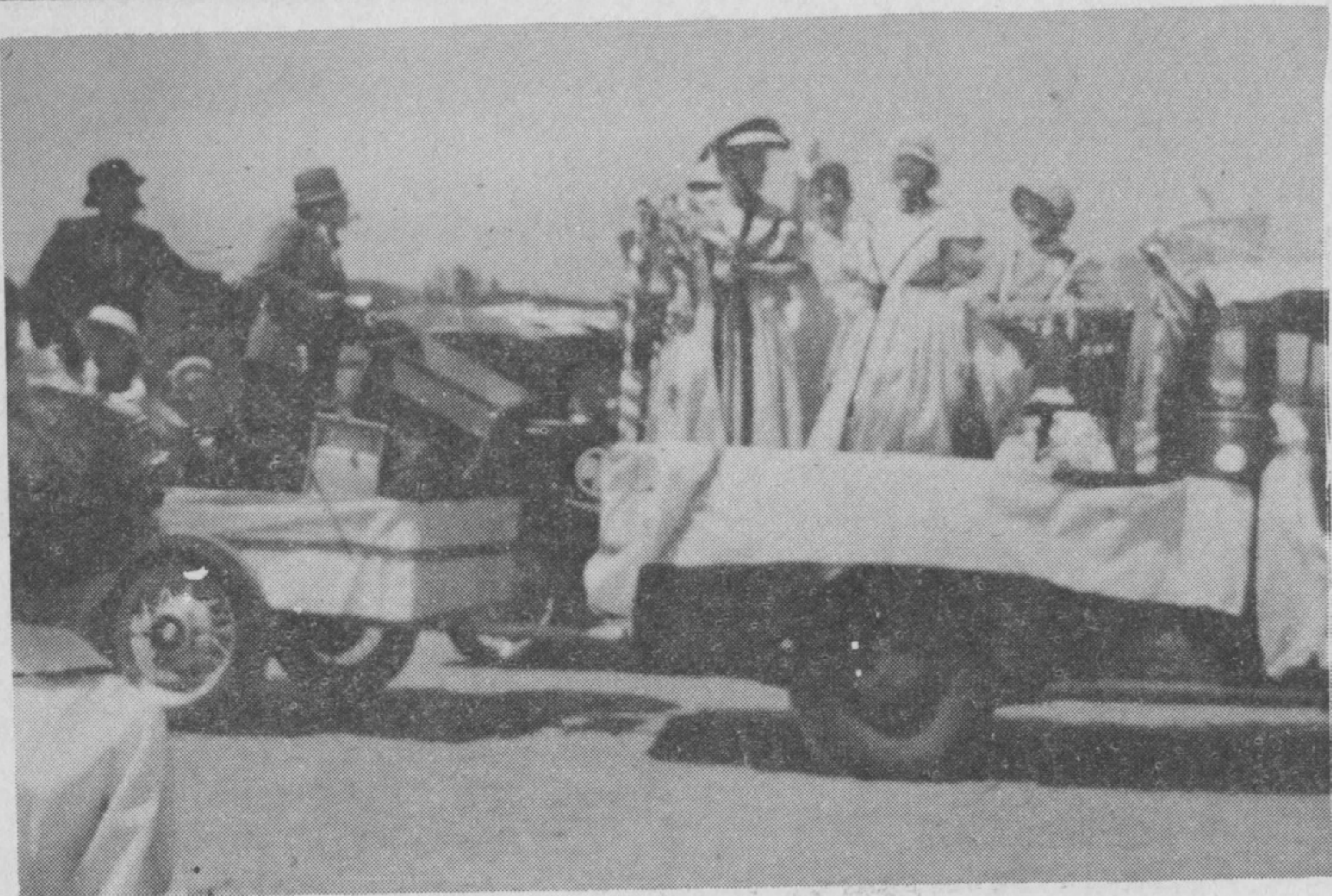
Riley float in recent parade with three generations in Centennial dress and household effects of a century ago.