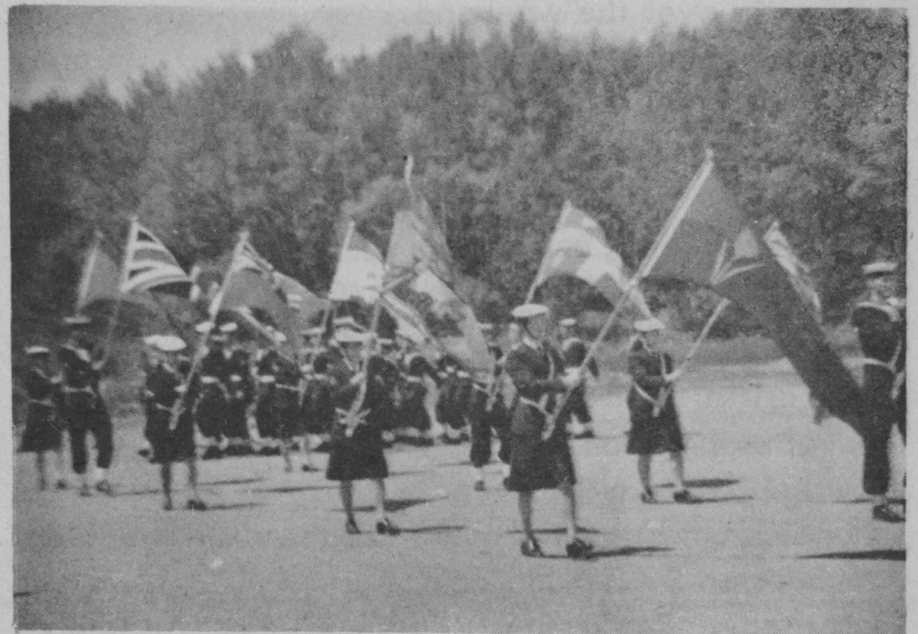
CEREMONY OF THE FLAGS PRESENTED

Ninety-six members of H.M.C.S. Griffon and R.C.S.C.C. Vindictive