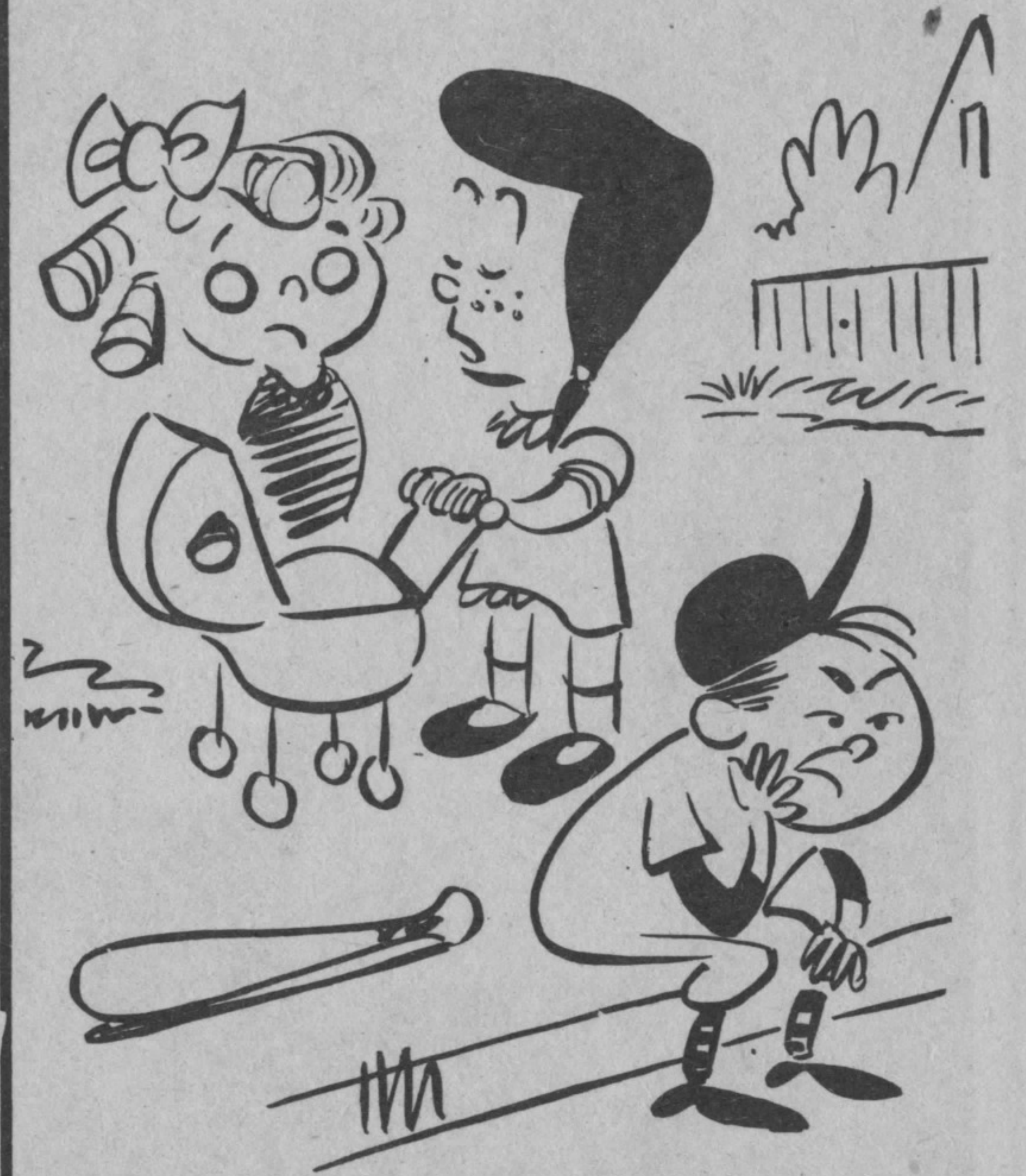
"He got caught stealing, and frankly I'm glad!"