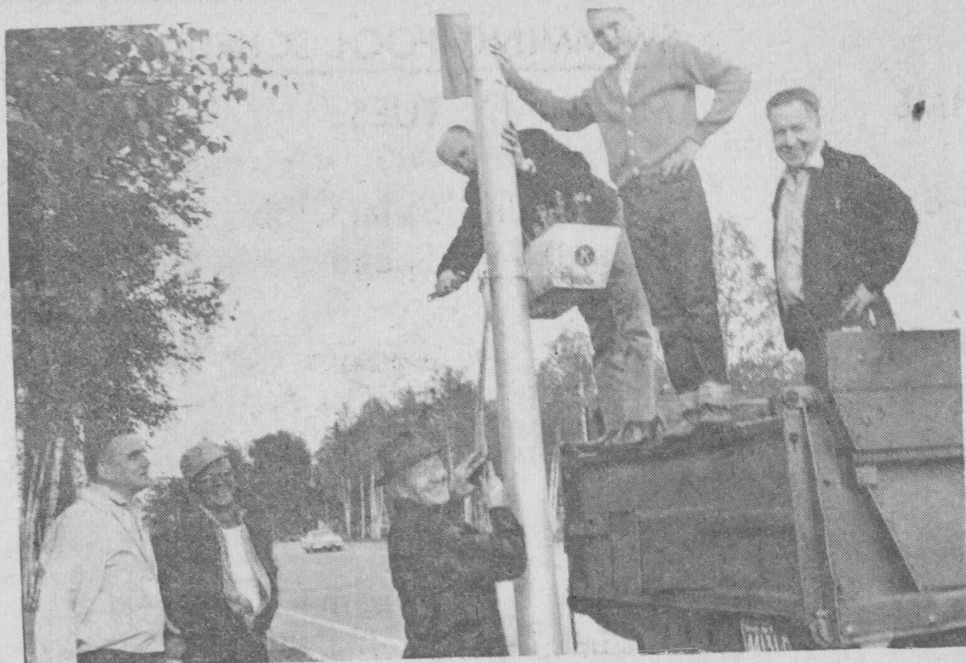
Kivans and Horticultural Society members beautify The Plaza.