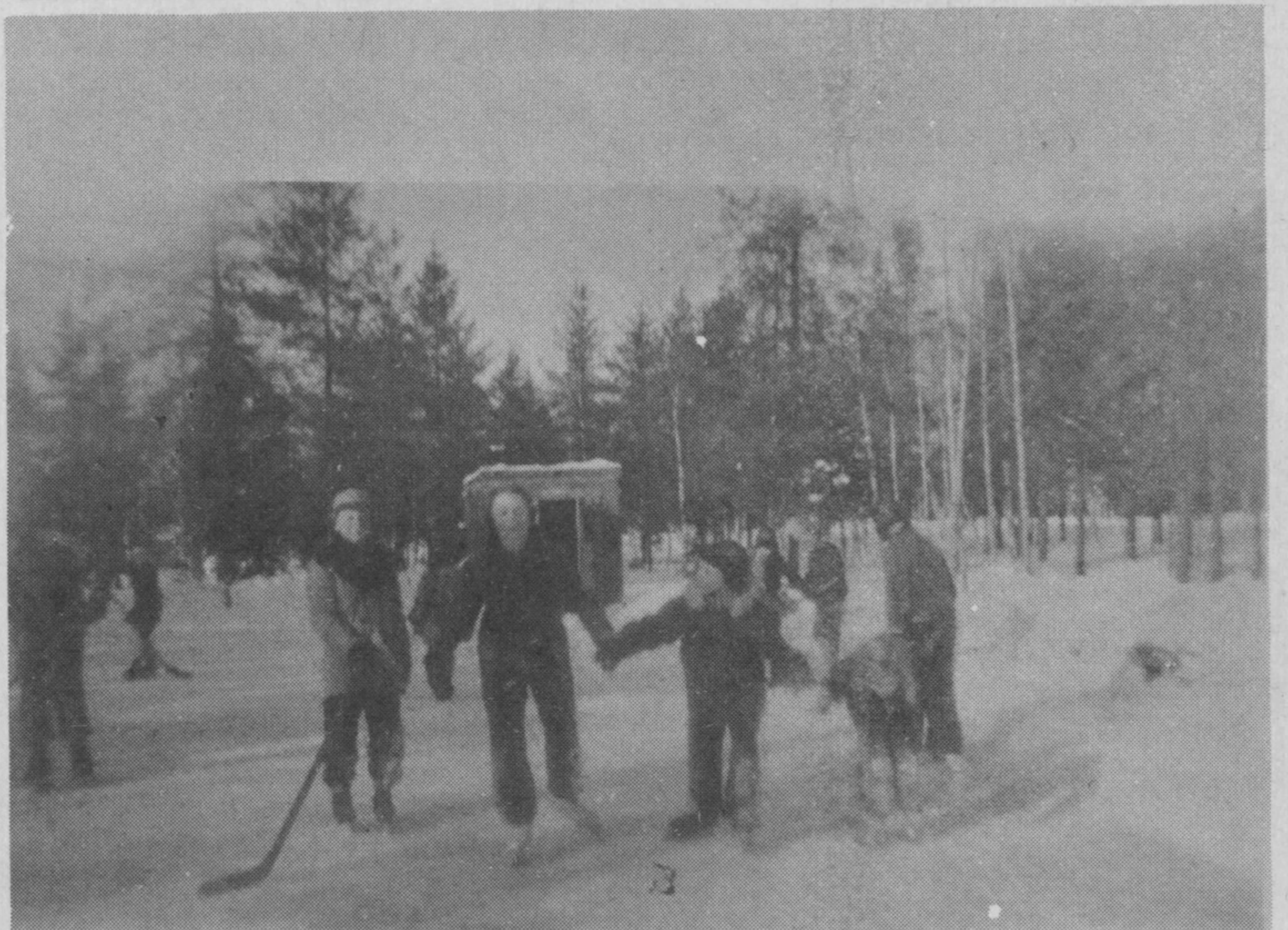
Skating In Terrace Bay Twenty-Five Years Ago.

More on the game and lineups will be in next week's News.