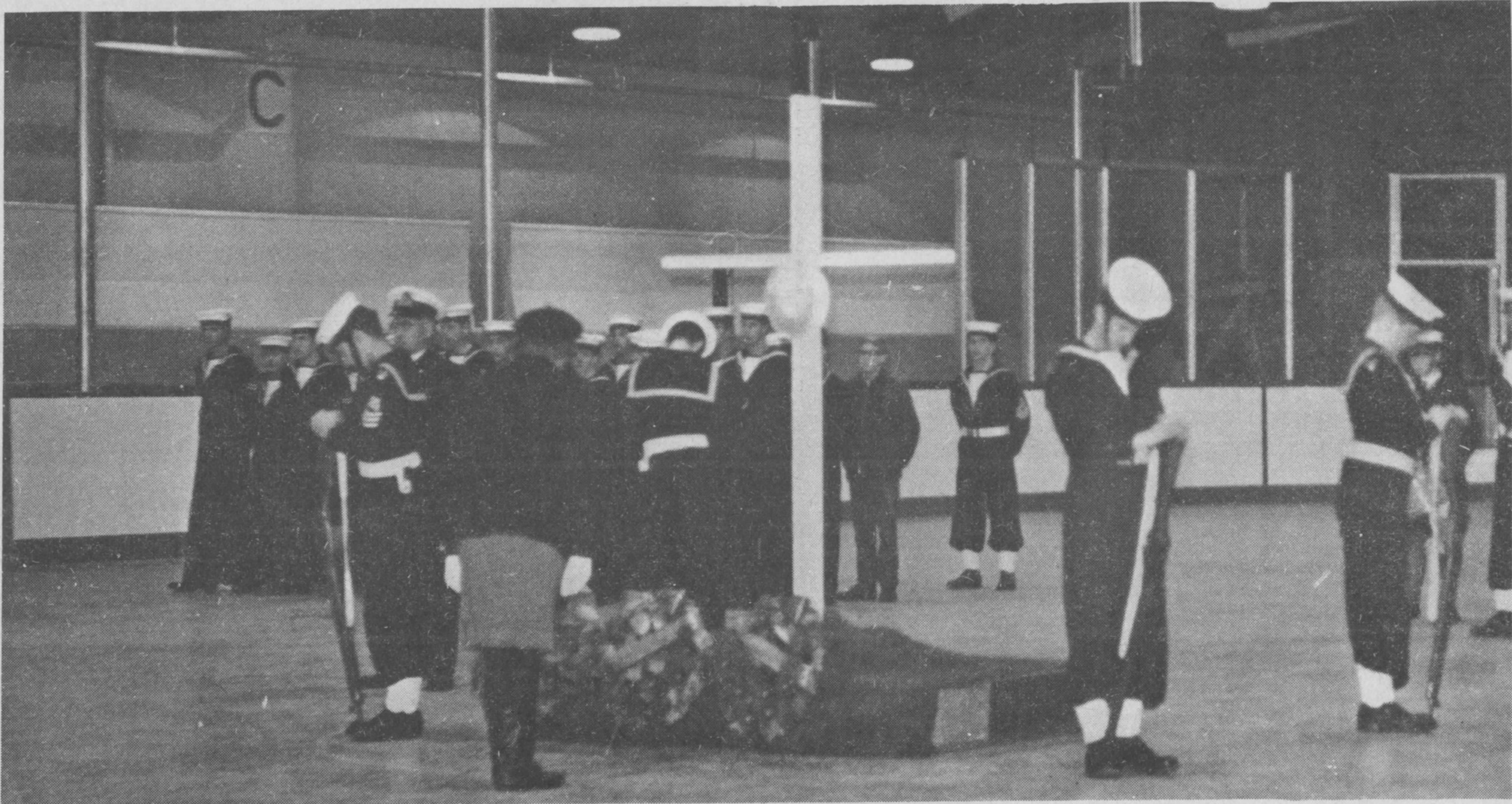
The President of the Ladies' Auxiliary to the Canadian Legion lays a wreath on the Memorial, flanked by Sea Cadet Honour Guard.