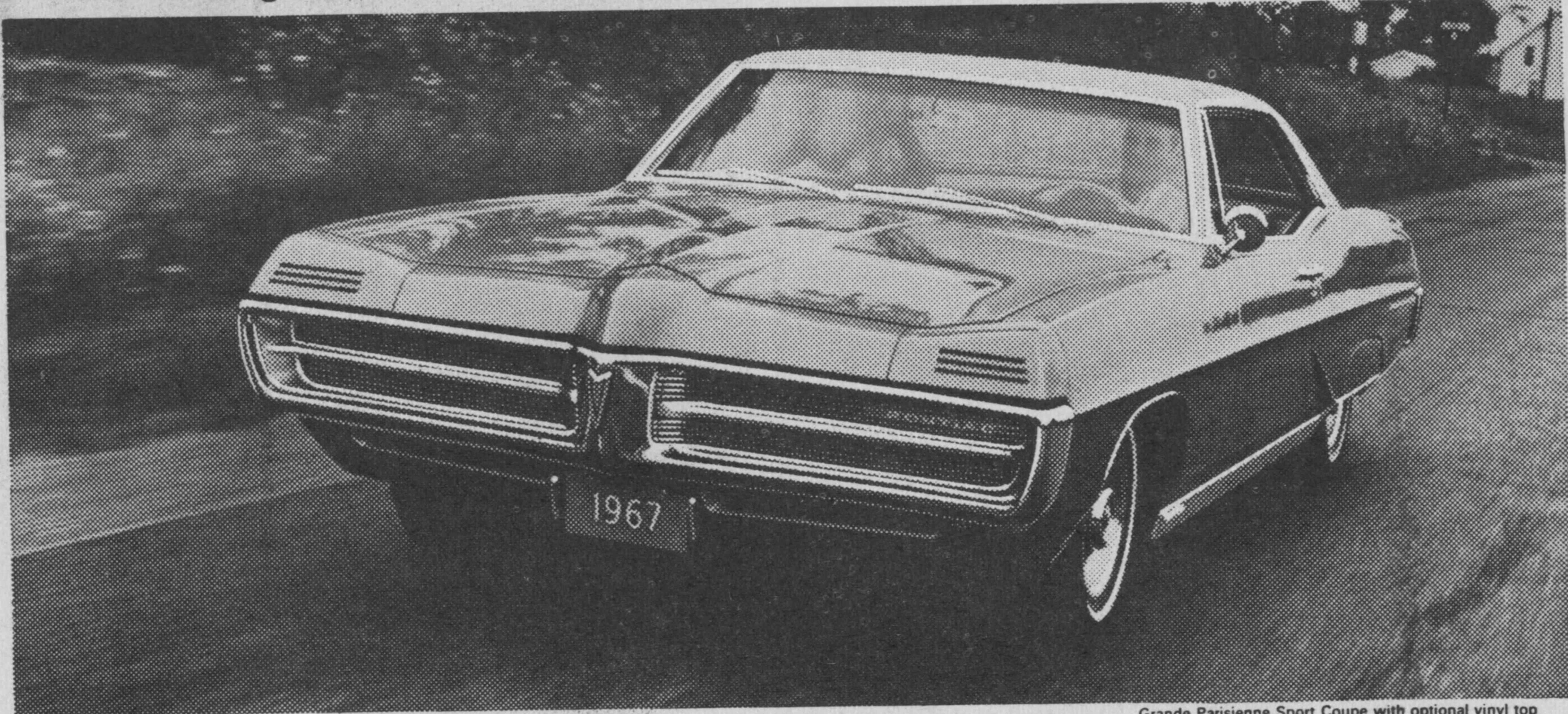
Grande Parisienne Sport Coupe with optional vinyl top

Introducing the adventurous new Pontiacs for 1967!