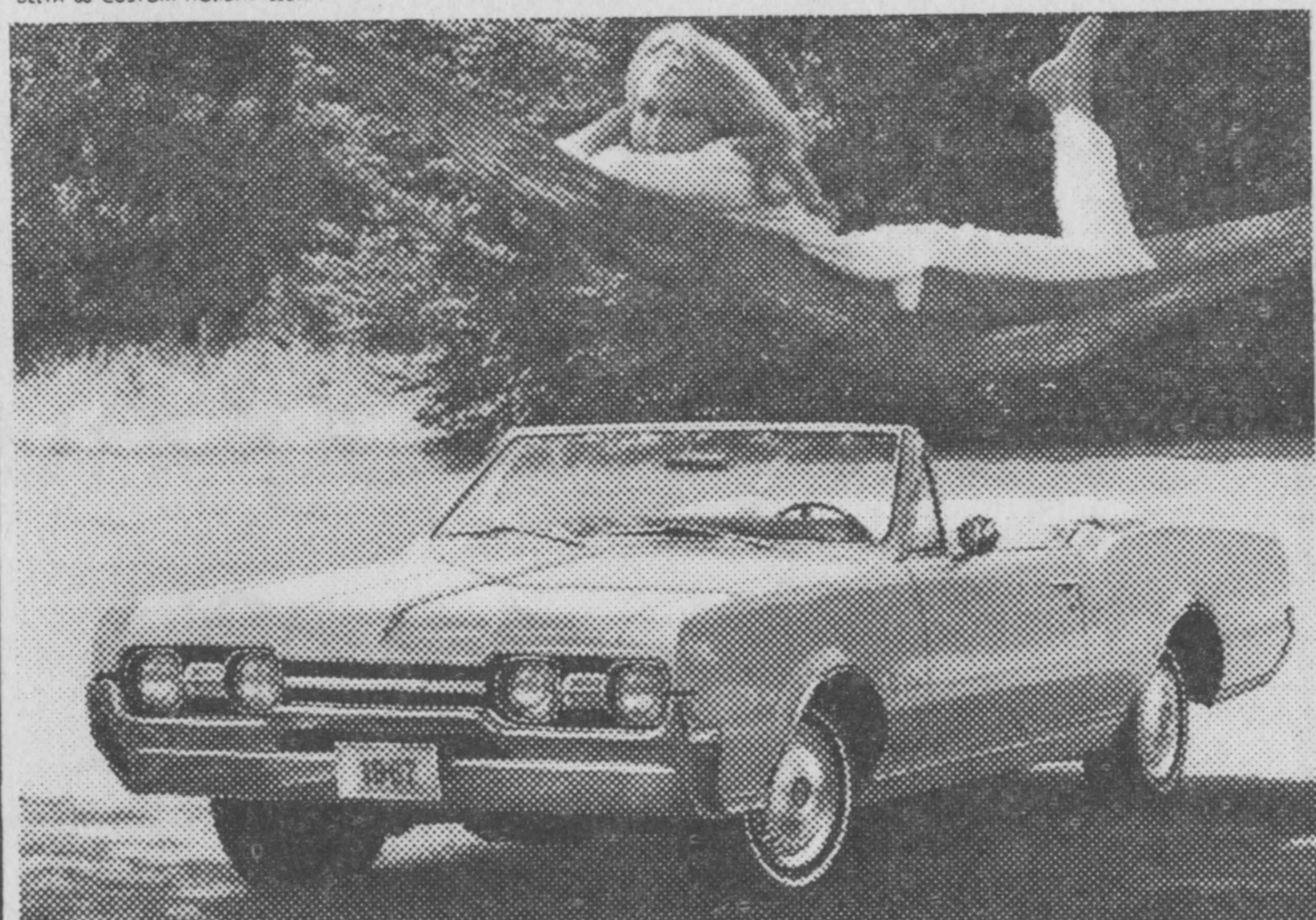
CUTLASS SUPREME CONVERTIBLE

Longer, racier hoods. Sporty rear decks. Fastback flair. The dashing Toronado inspired the Oldsmobile look for 1967.