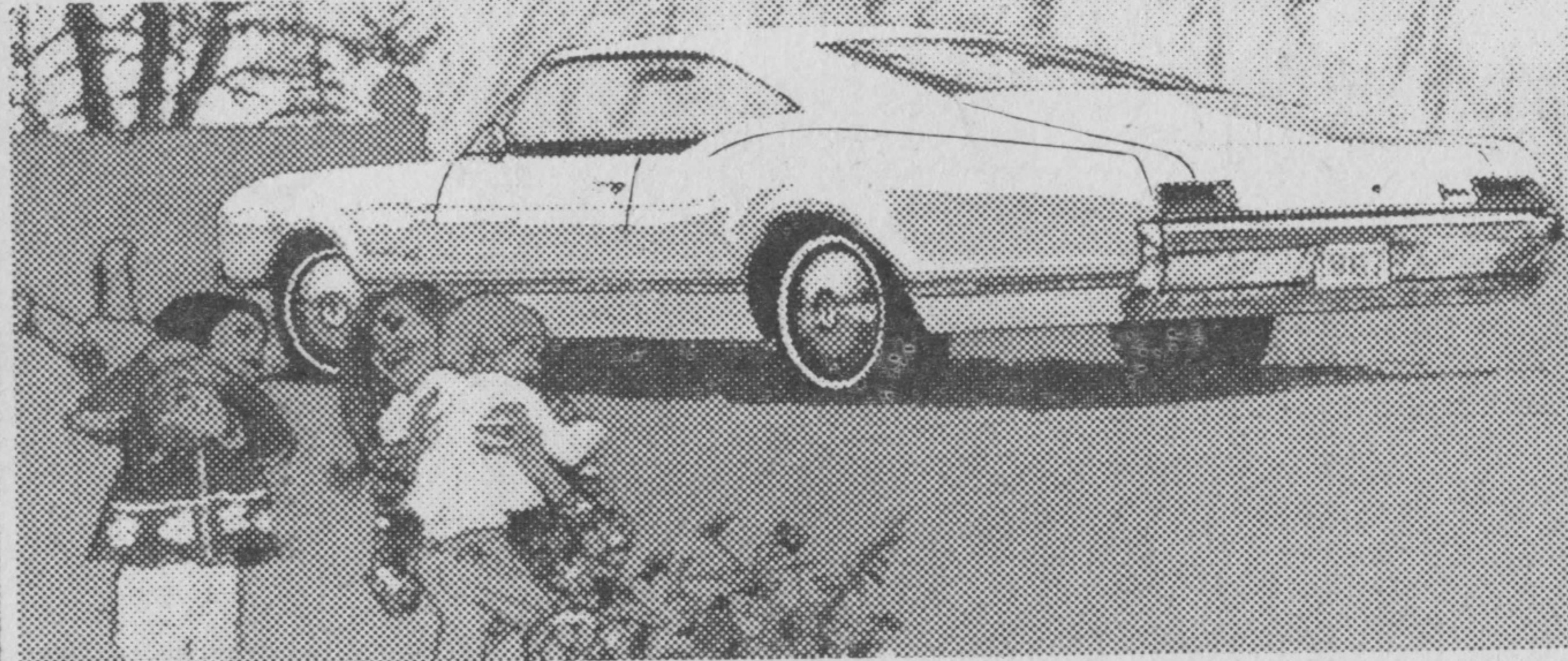
DELMONT 88 HOLIDAY COUPE