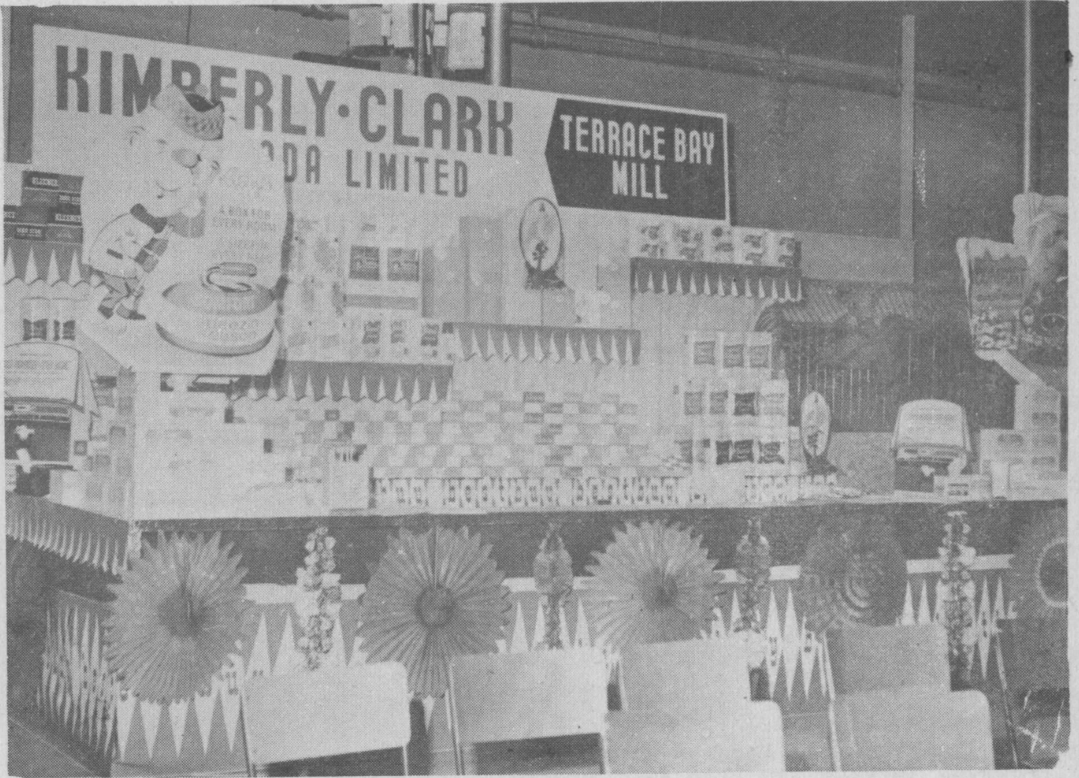
An outstanding booth where products produced by Kimberly-Clark Corporation were displayed and pocket packs of Kleenex were distributed.