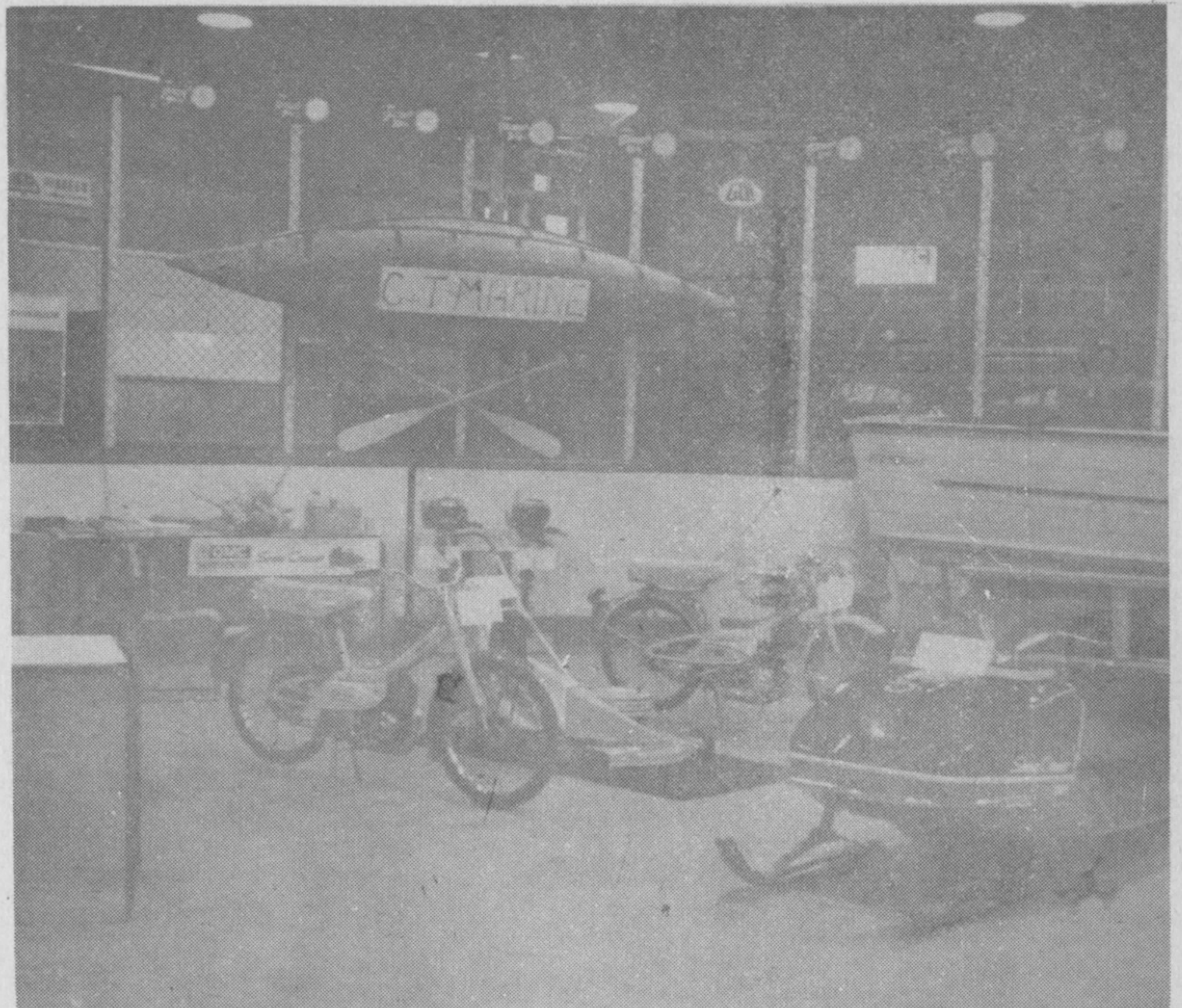
A display which attracted much attention and included a new compact trailer. The birch bark canoe hung on background was hand made by the grandfather of one of the owners. C & T Marine - a local venture - are expanding their line.