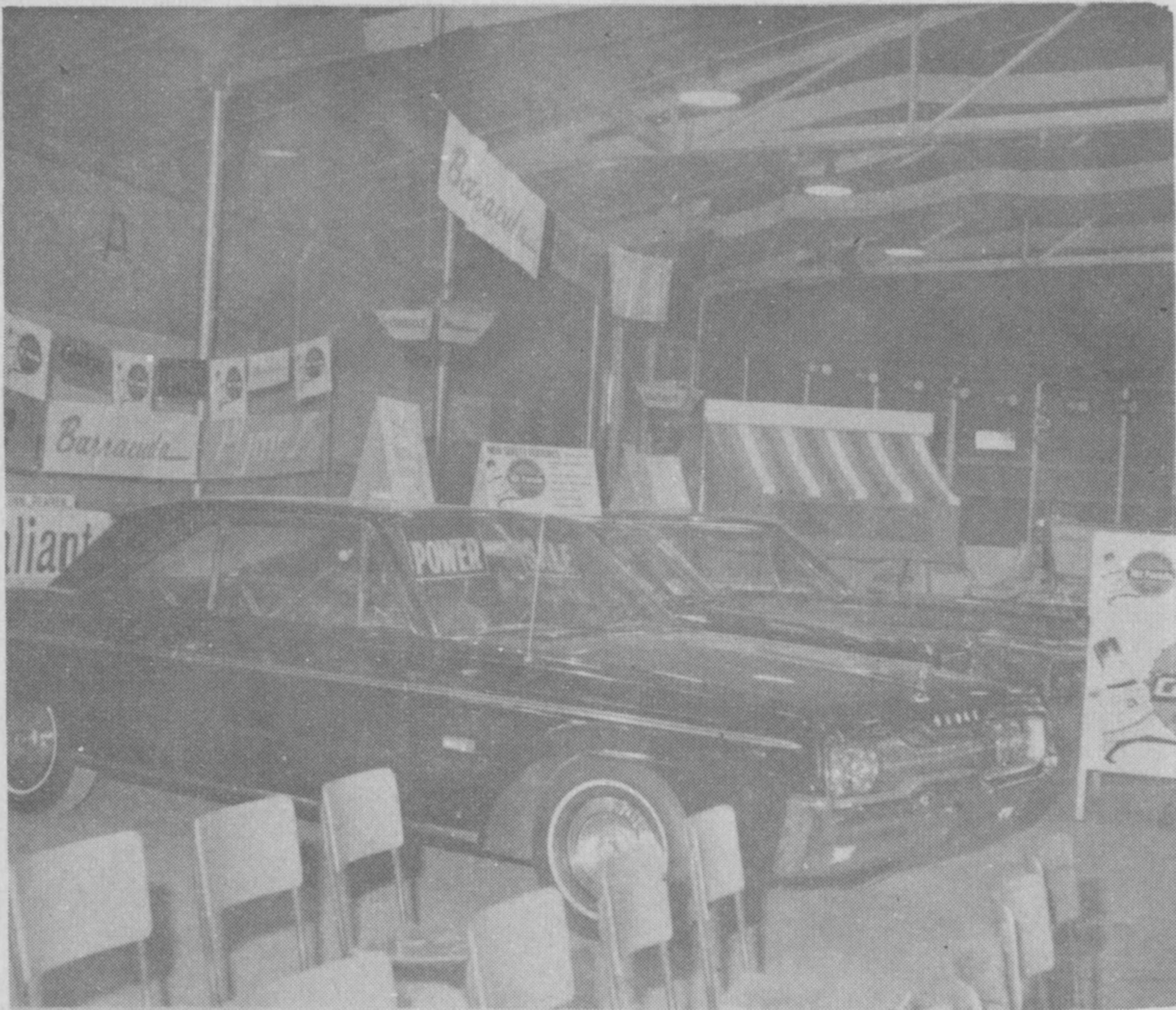
Circle Route Garage displayed Chrysler Products