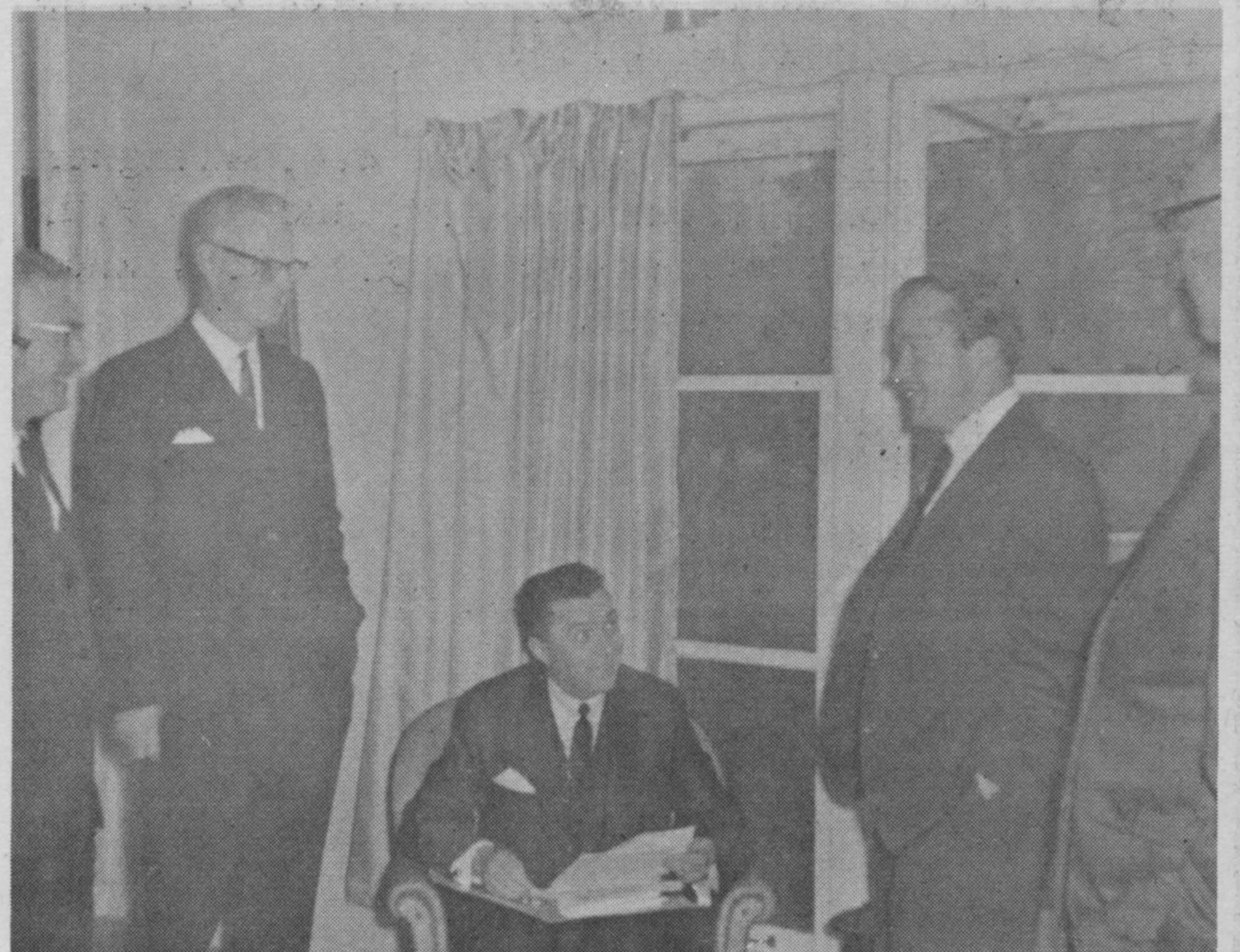
MEMBER OF PARLIAMENT VISITS TERRACE BAY

Last dates for payment without penalty are June 24th and August 24th.