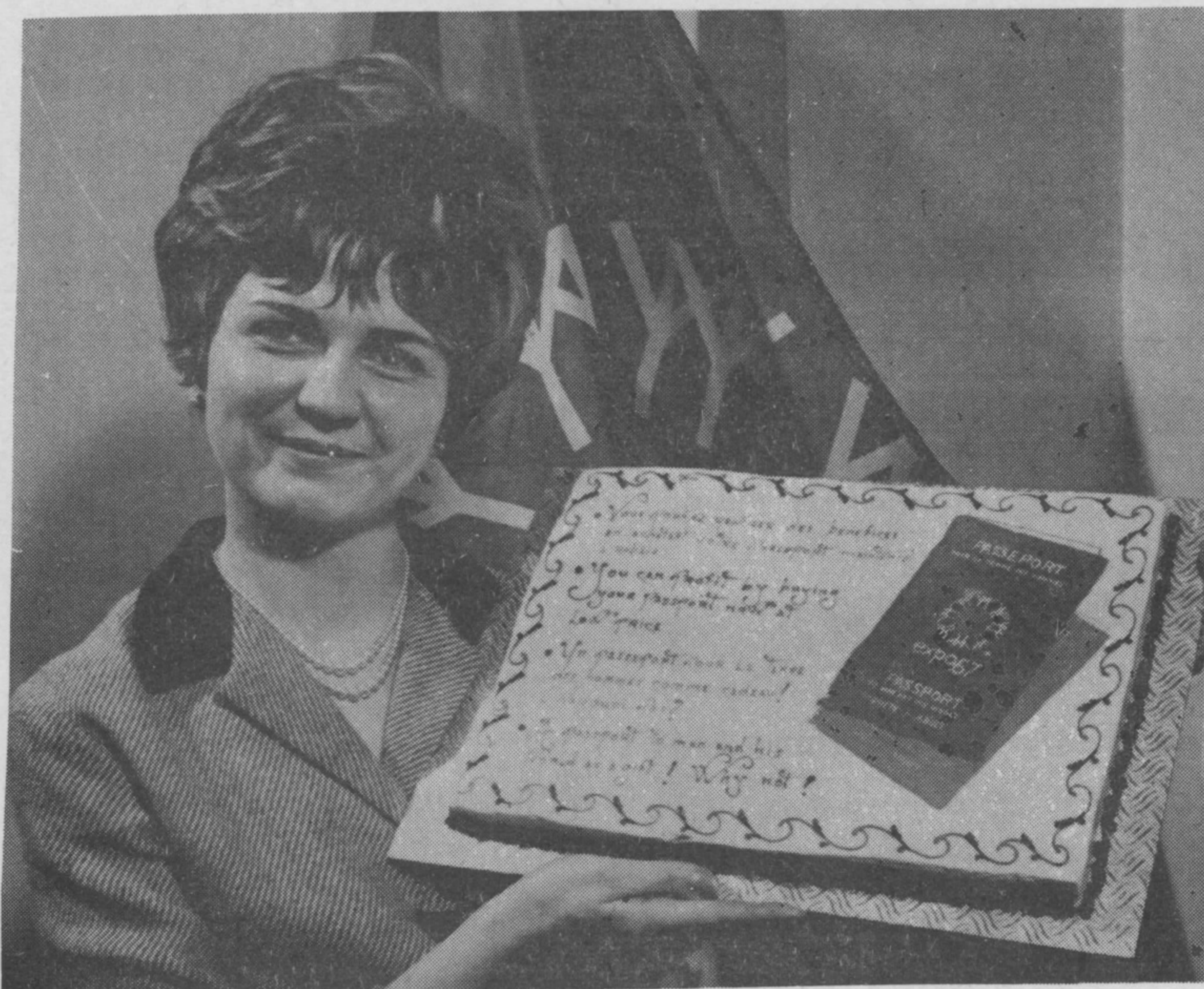
Expo Photo -