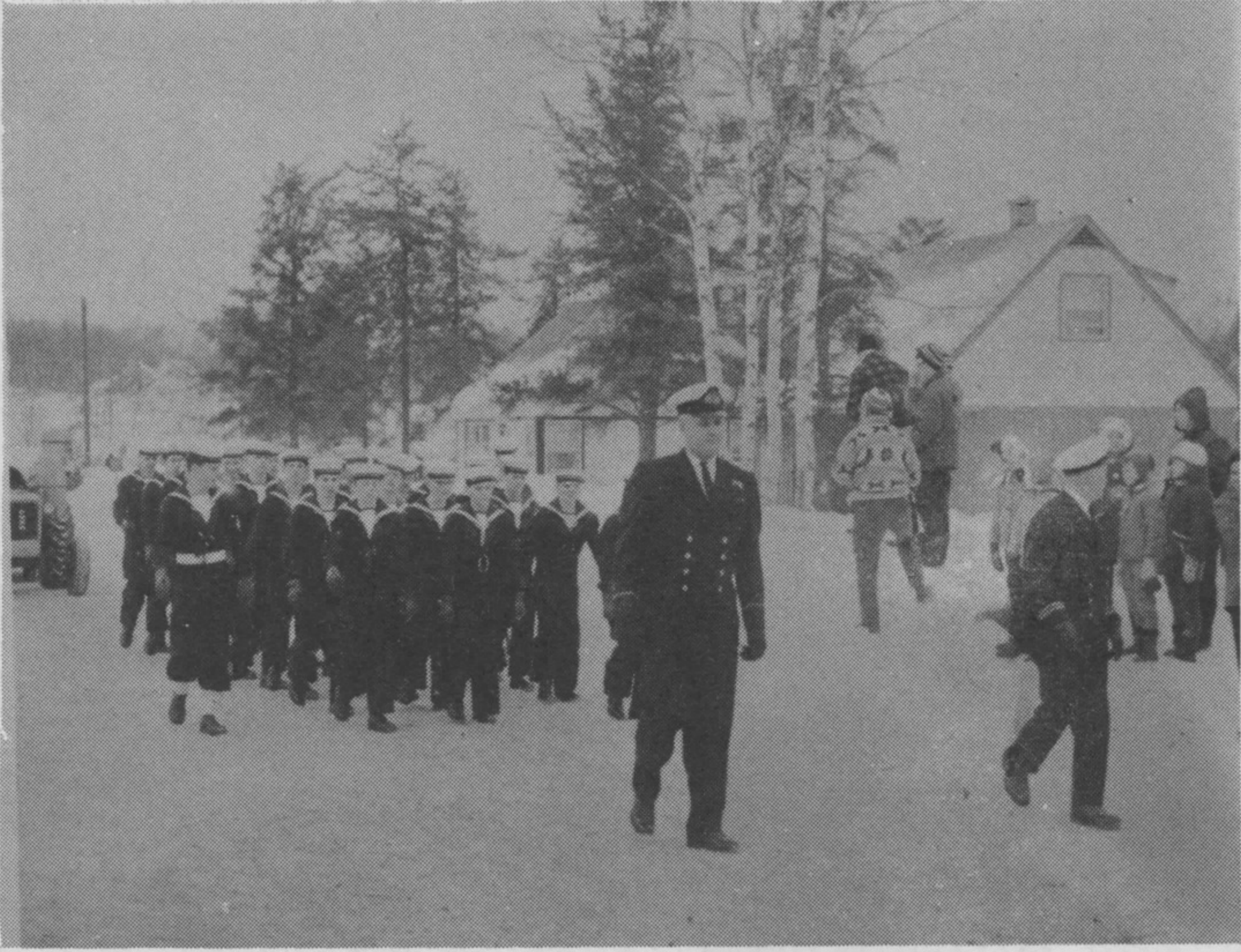
Local Sea Cadet Corps