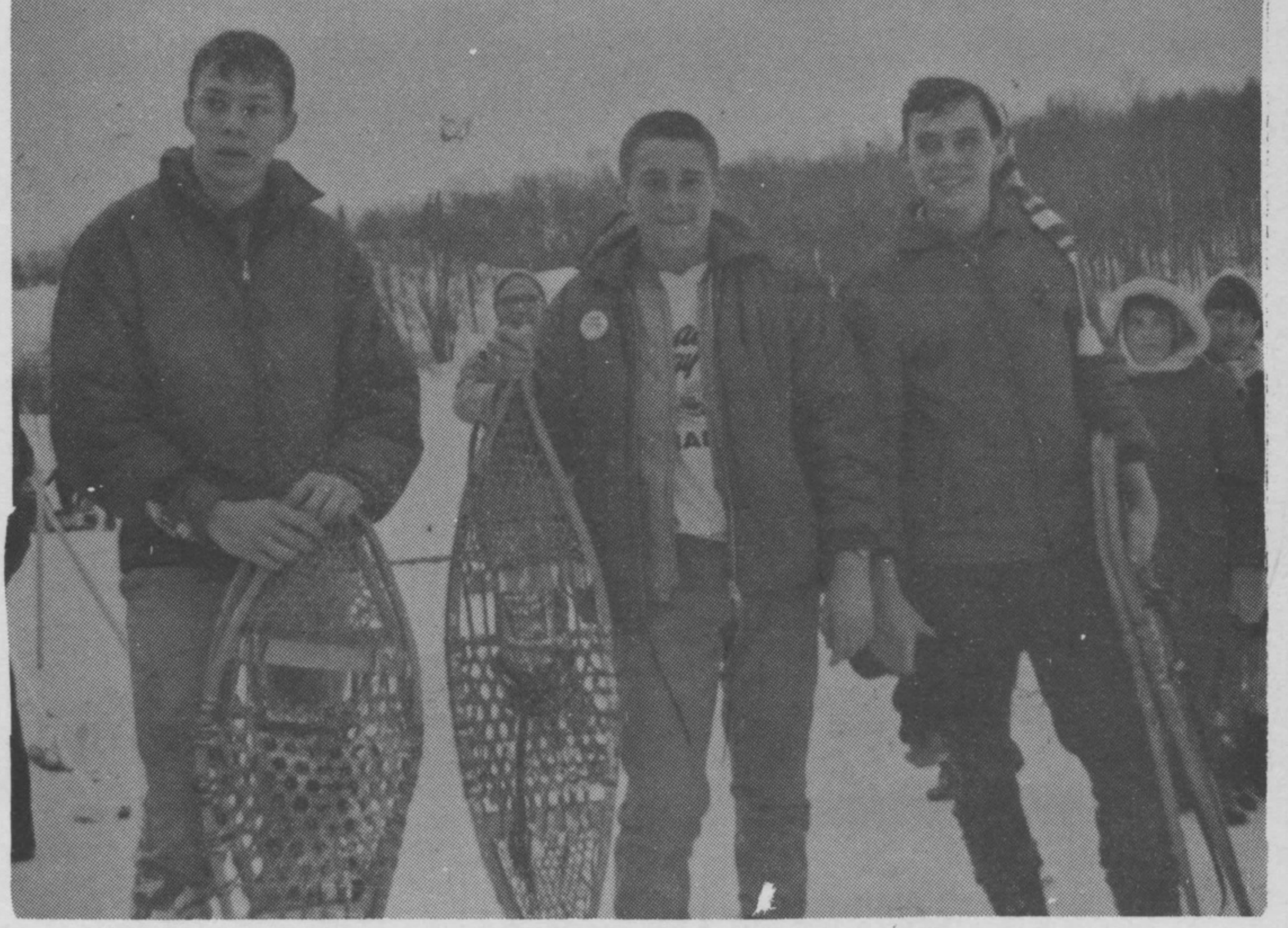
Boy's snow shoe race