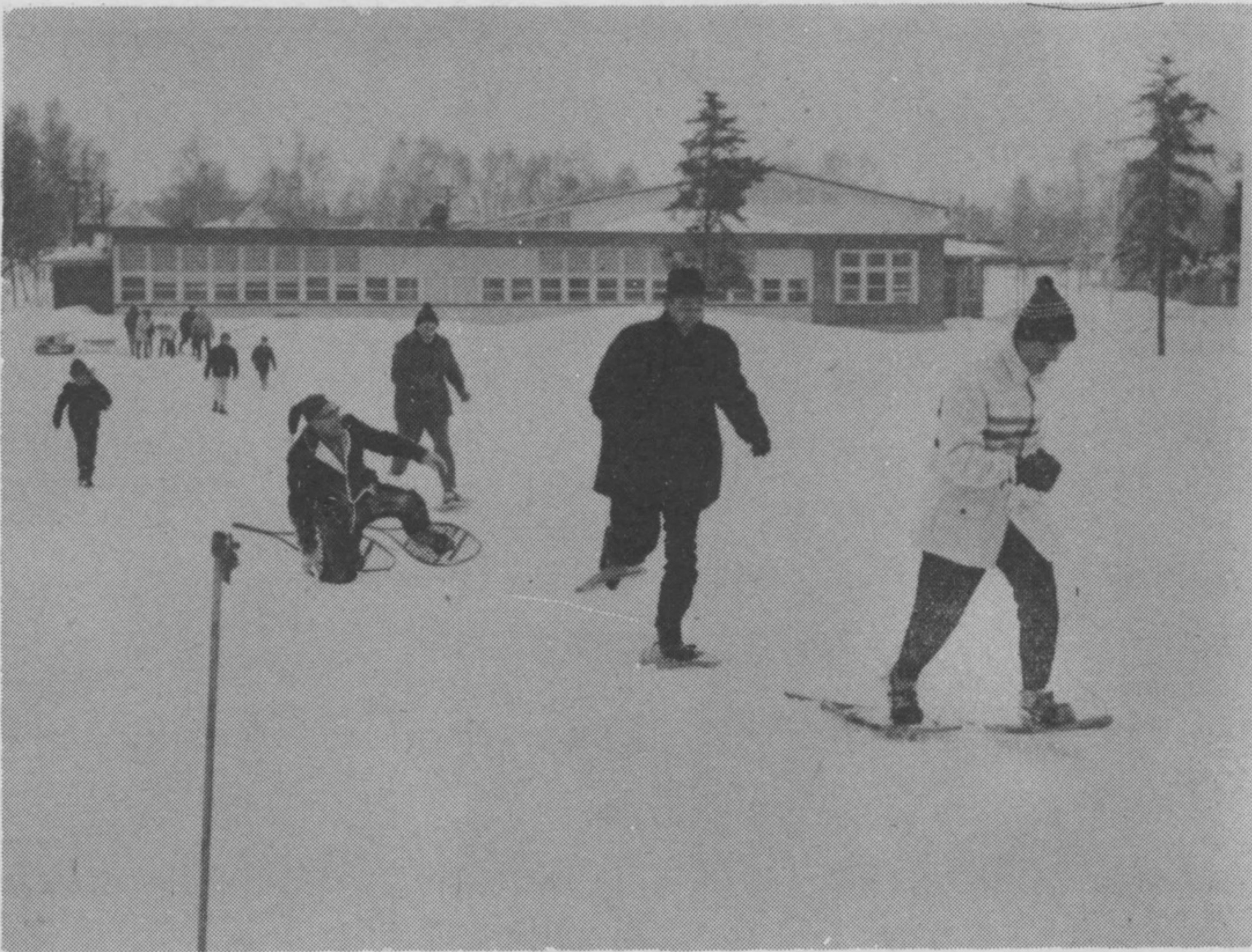
Men's snow shoe race