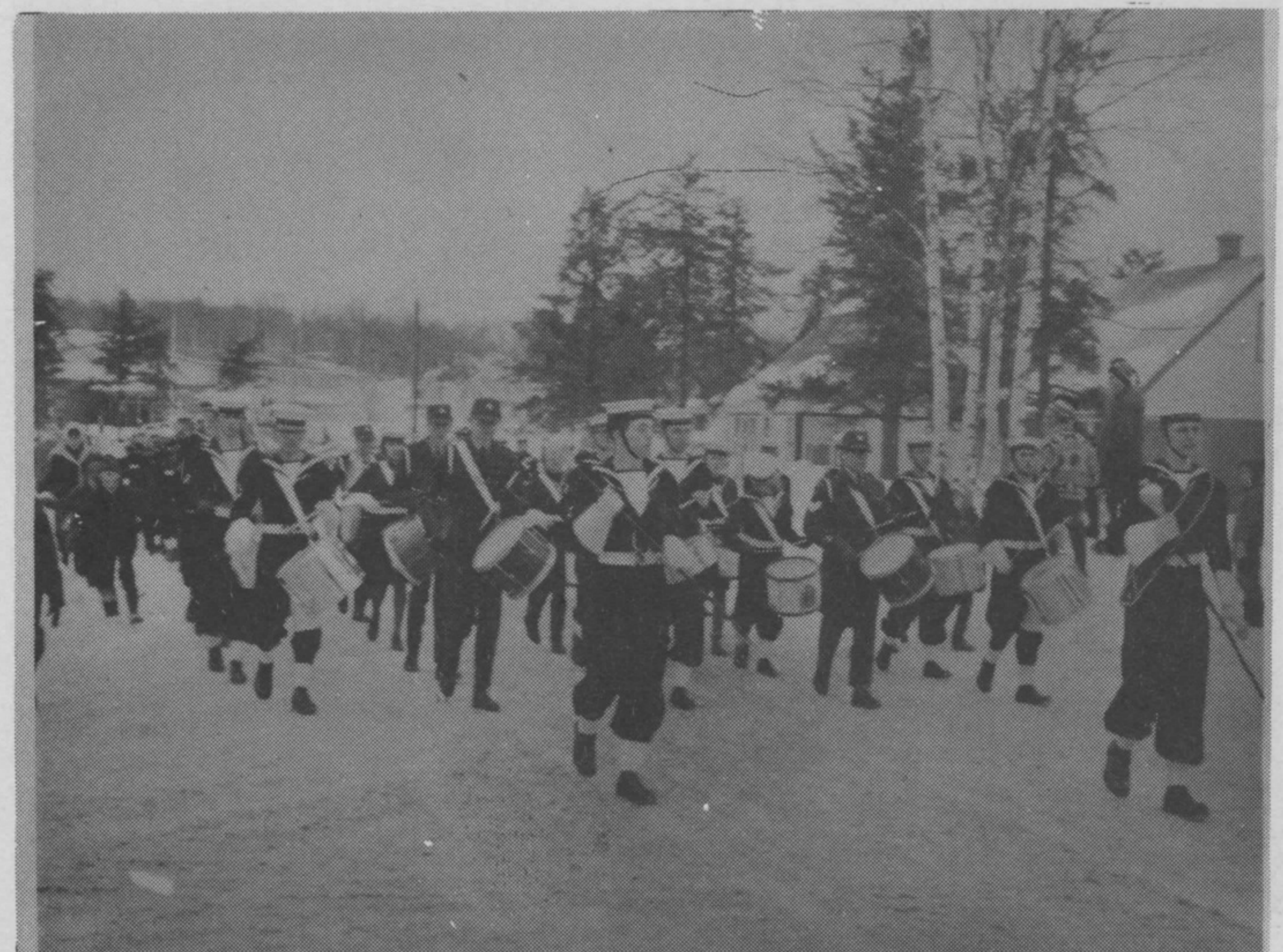
Sea Cadet Band