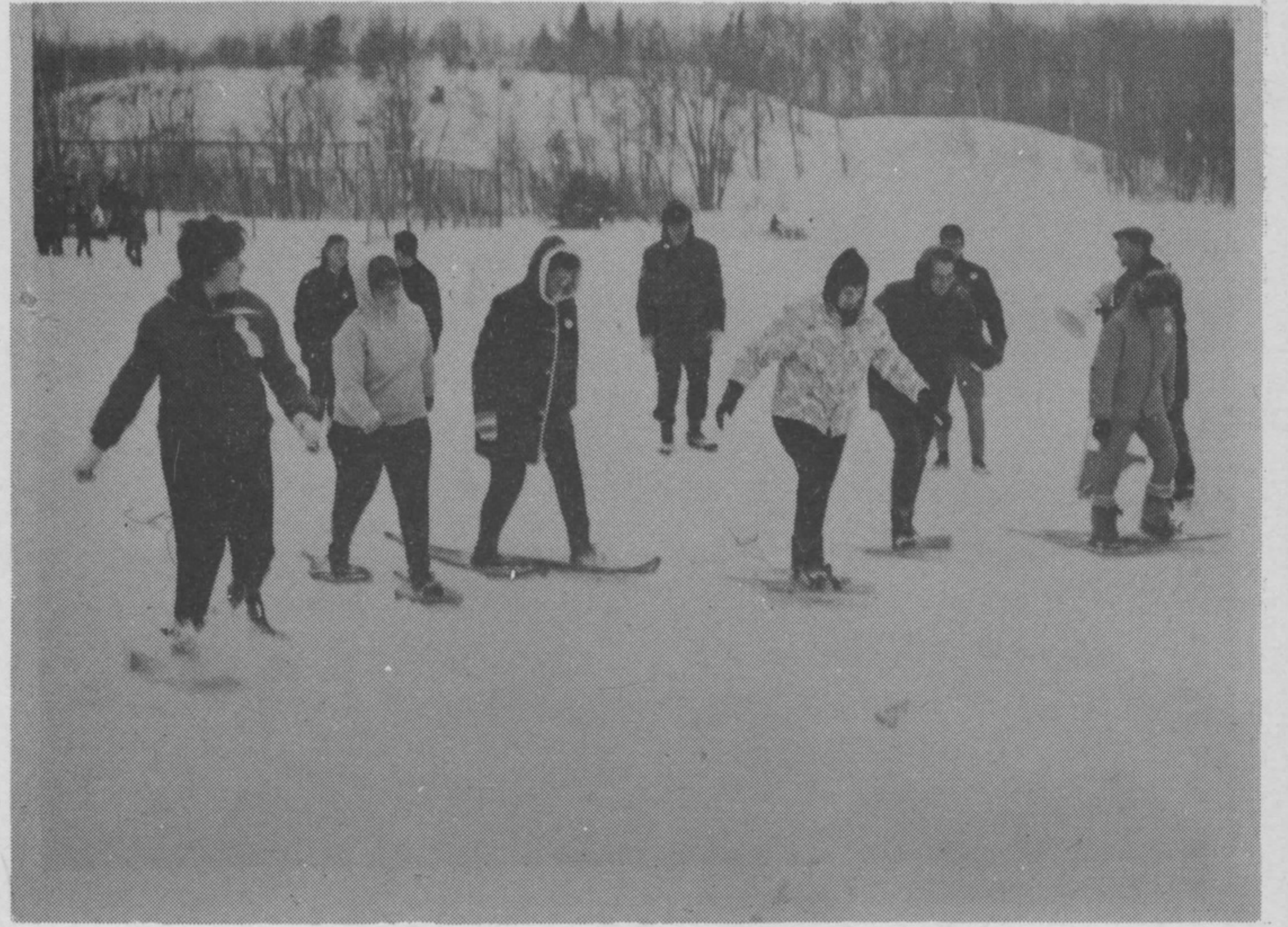
Ladies' snow shoe race