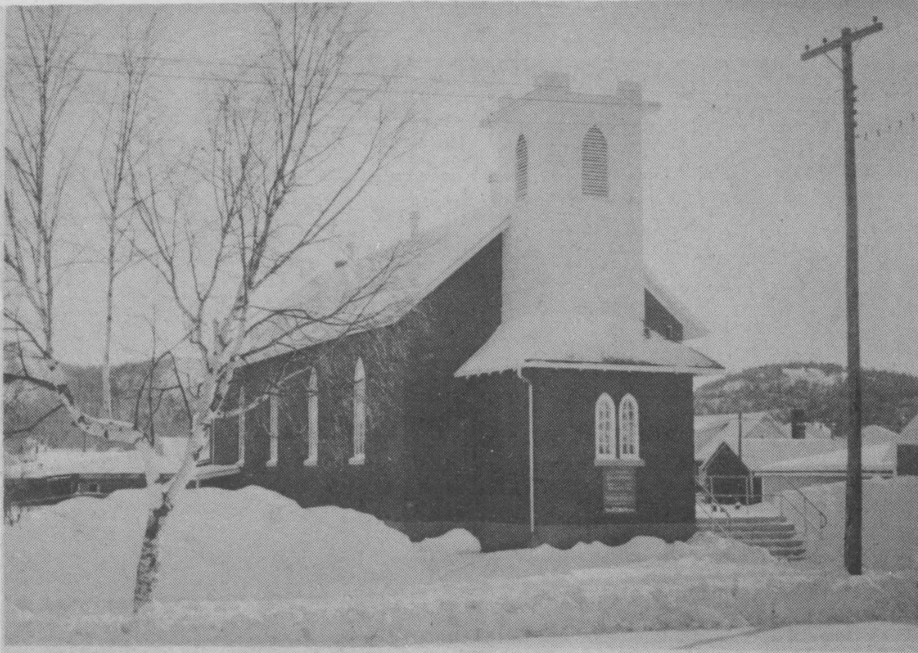
Schreiber United Church