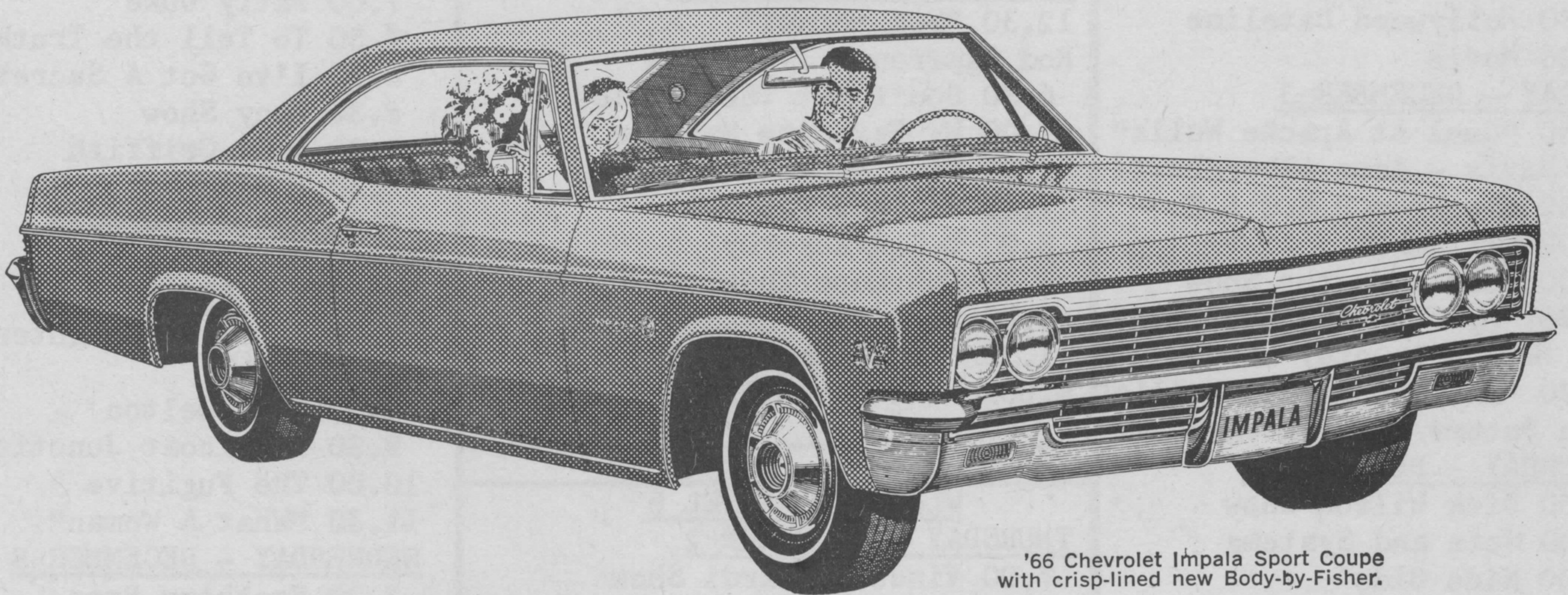
'66 Chevrolet Impala Sport Coupe with crisp-lined new Body-by-Fisher.